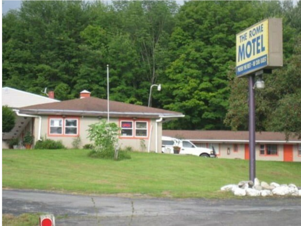
Rome Motel - Exterior