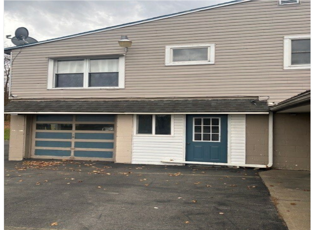
Apartment Entrance - Garage