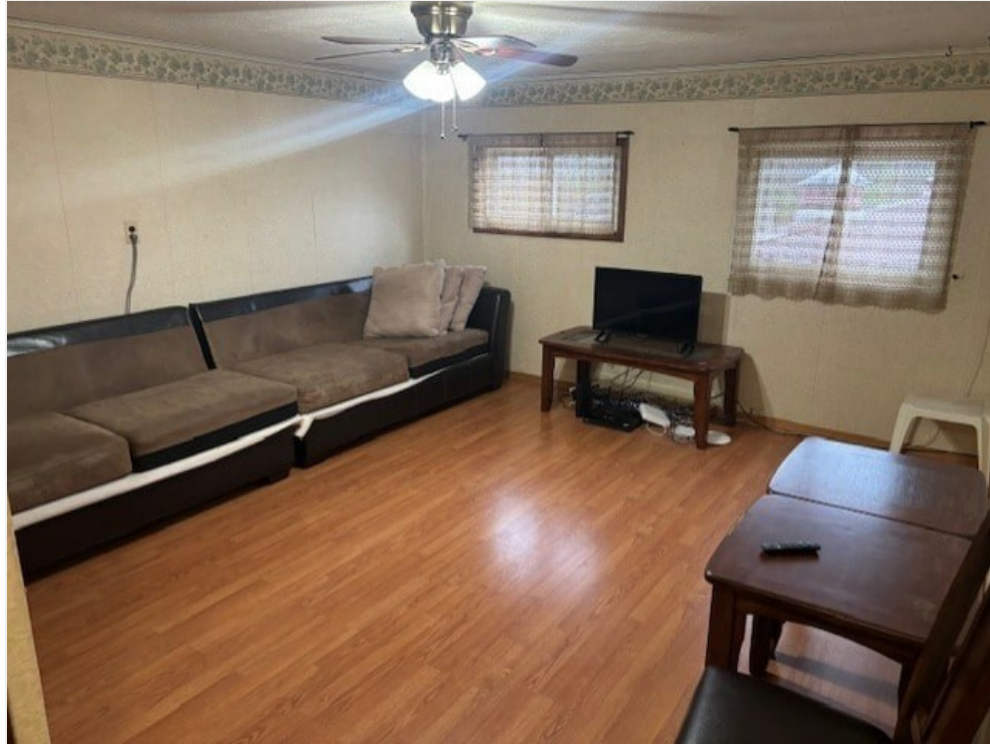
Apartment Living Room