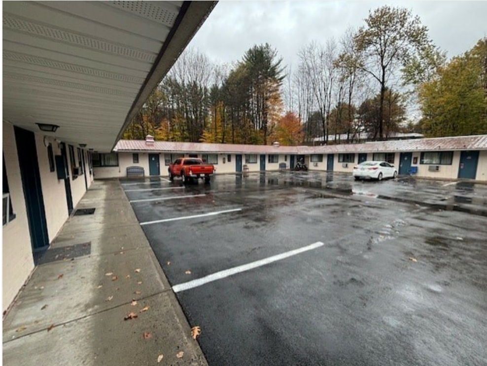
Exterior of Motel