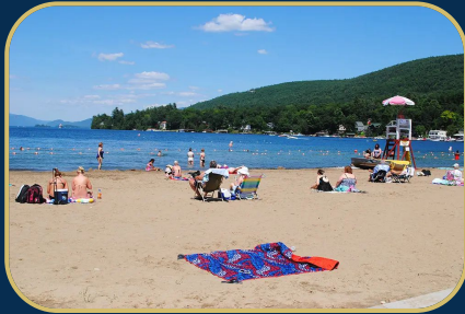
Million Dollar Beach