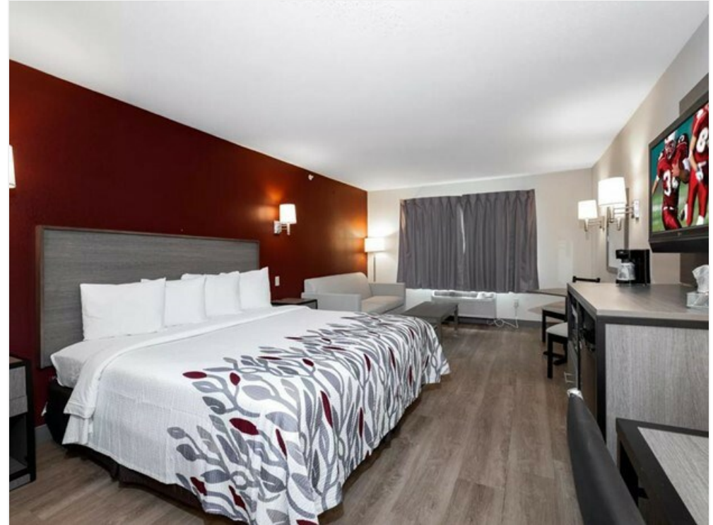
King Suite with Jetted Tub