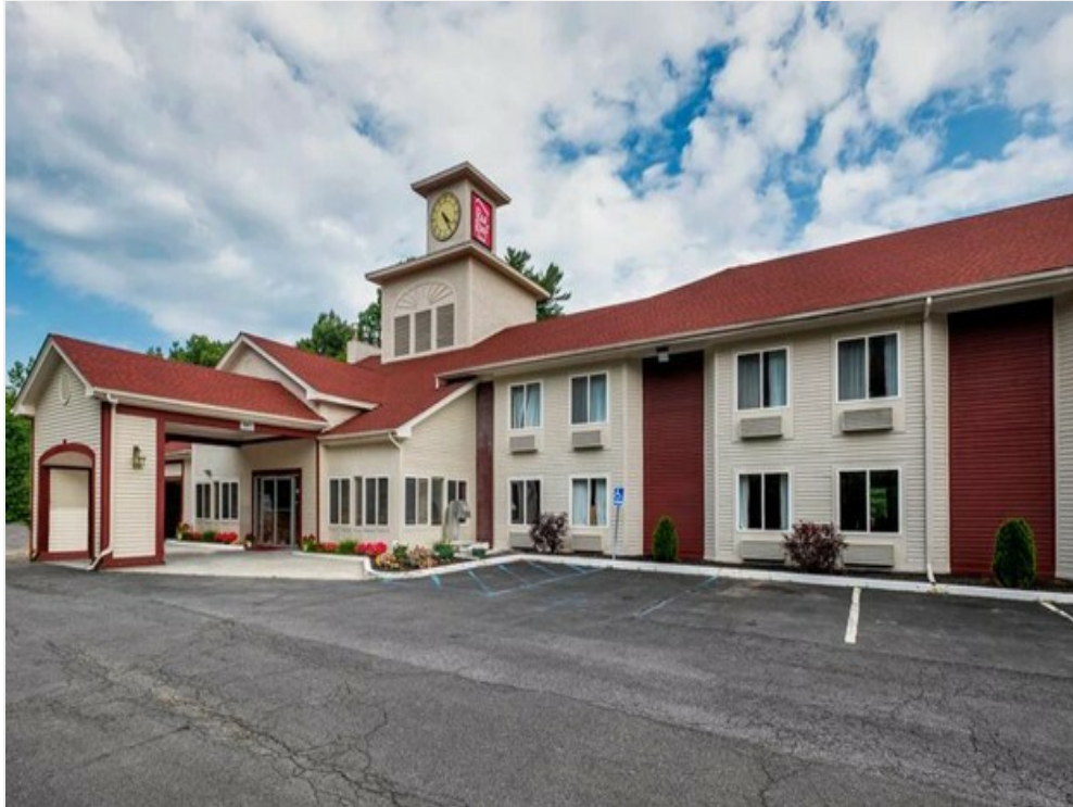
Red Roof Inn Clifton Park