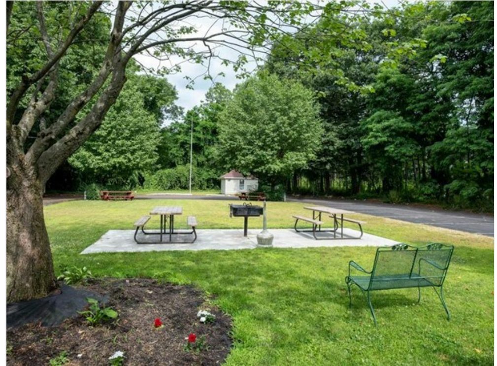
Lovely Grounds and BBQ Area