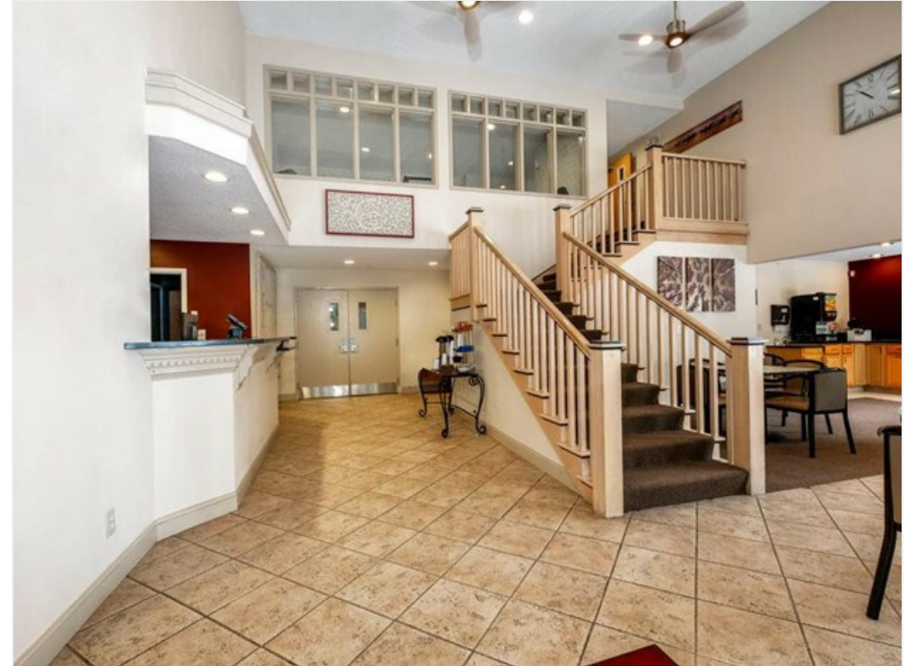
Lobby Red Roof Inn