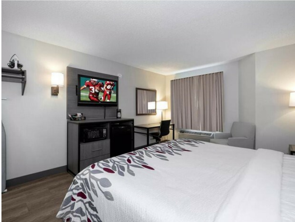
Superior King Guest Room