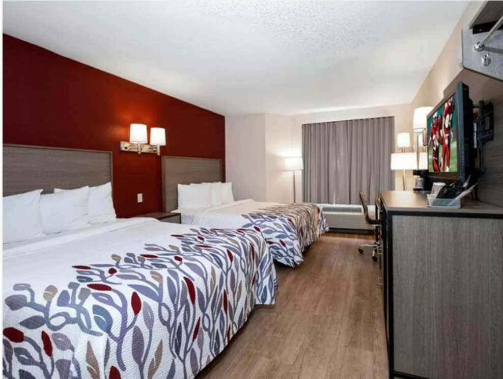
Double Queen Guestroom