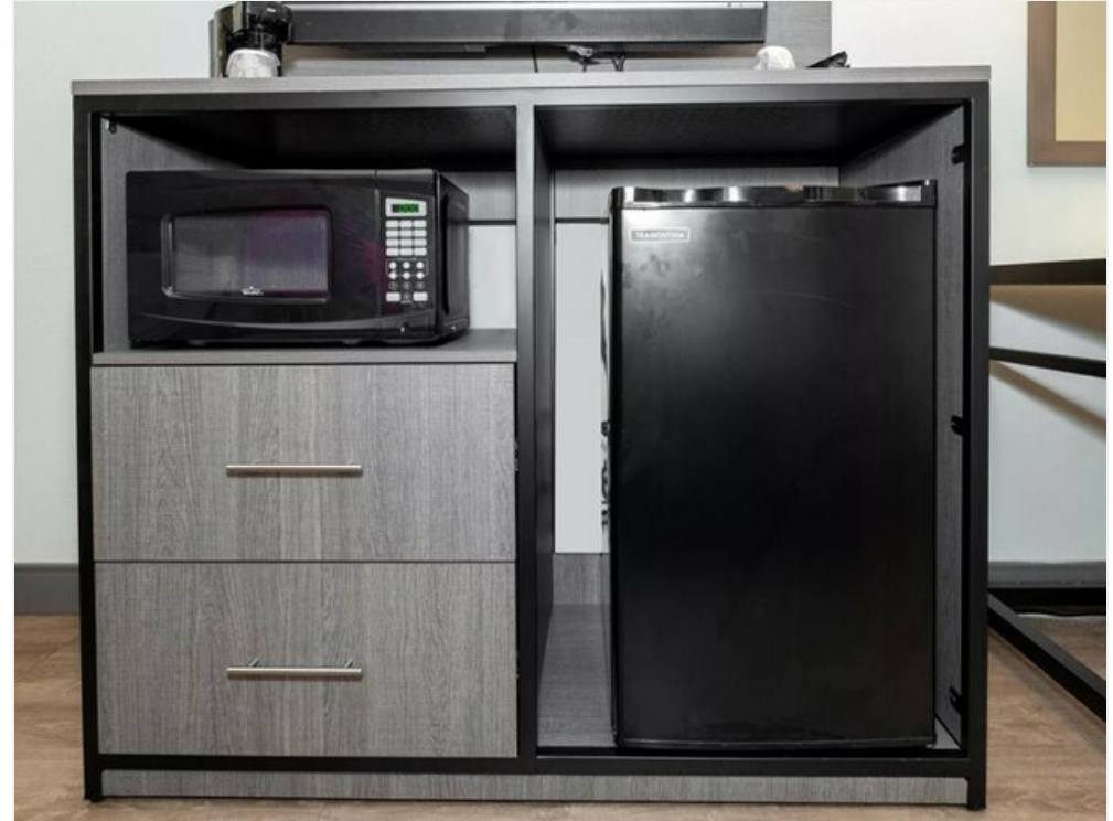
Microwave and Mini Fridge in every Room