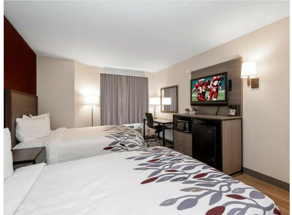
Double Full Bedded Guestroom