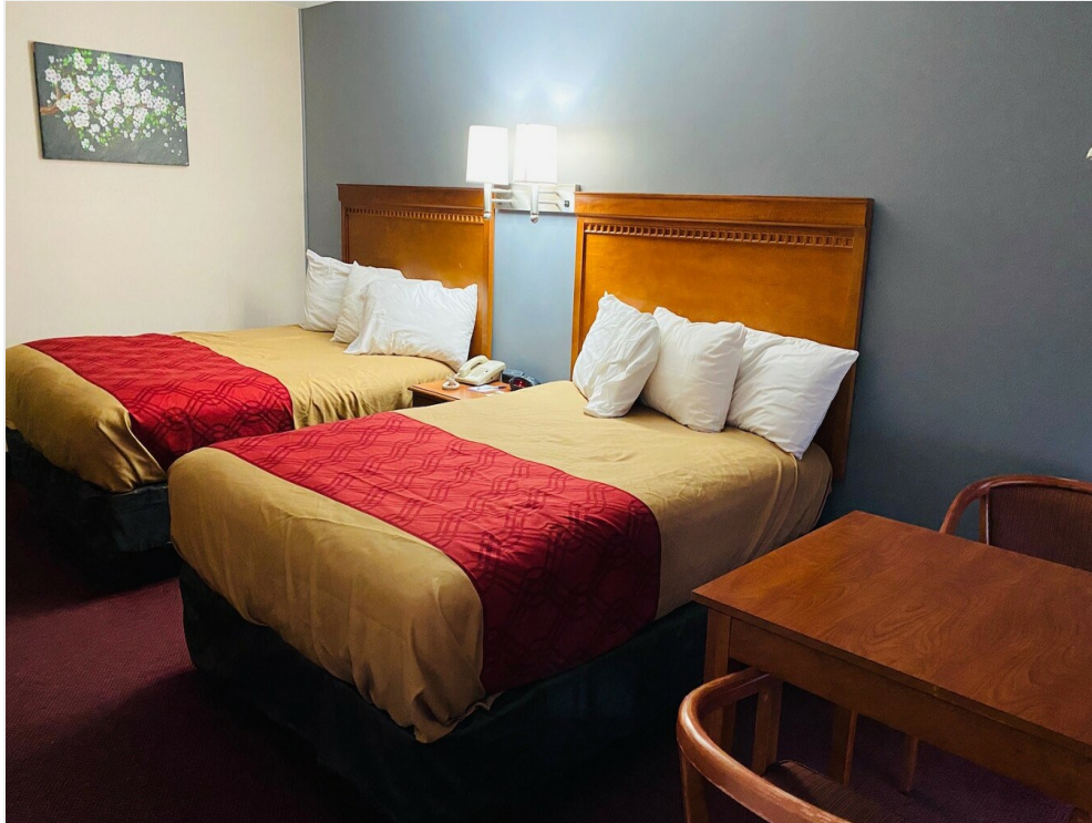
Double Queens and Double Doubles