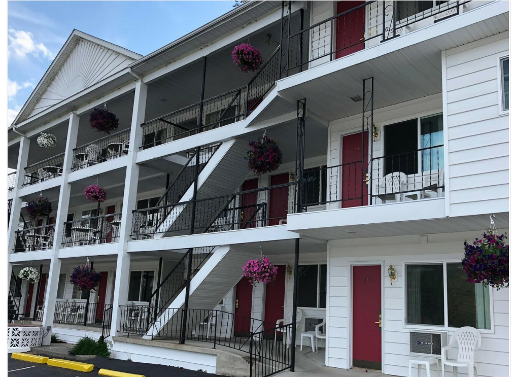
Three Floors and Interior Elevator