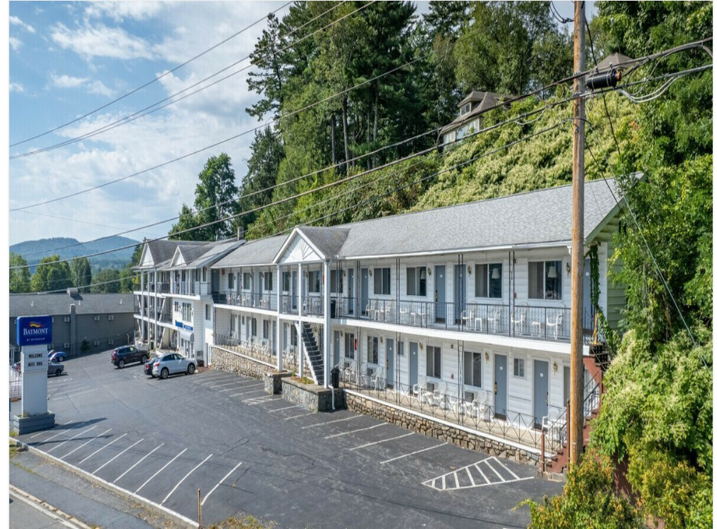
Hotel & Sign