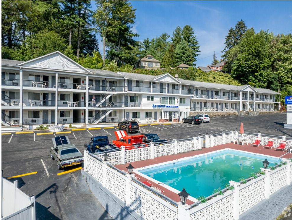
Baymont by Wyndham Lake George