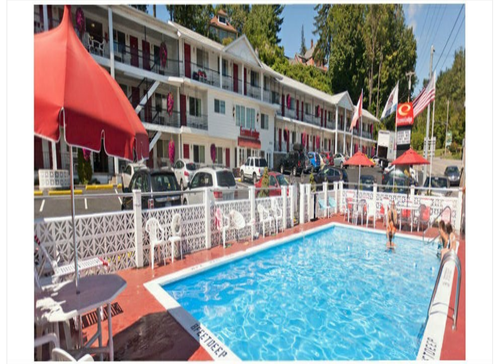
Beautiful Outdoor Pool