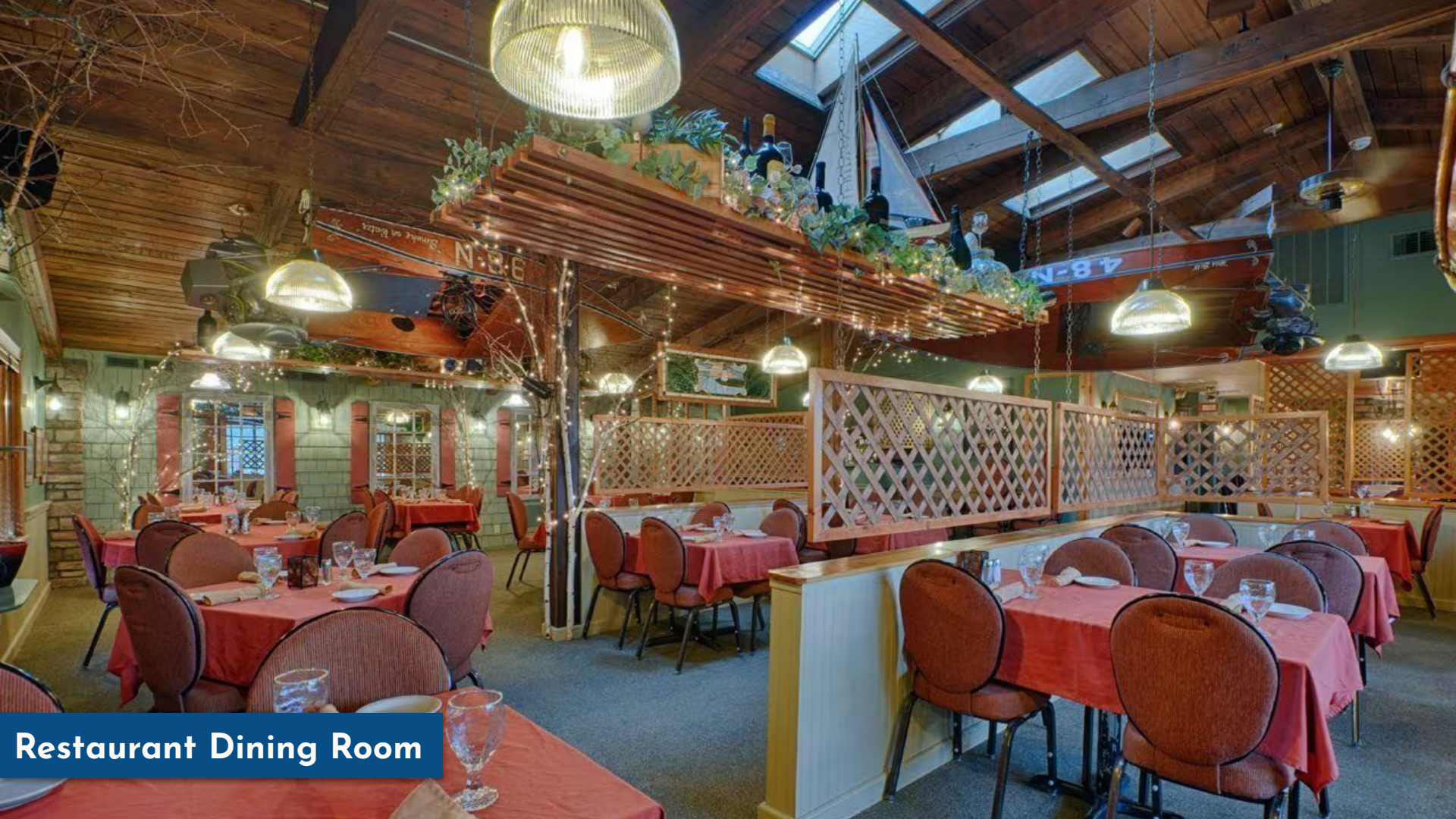
Restaurant Dining Room