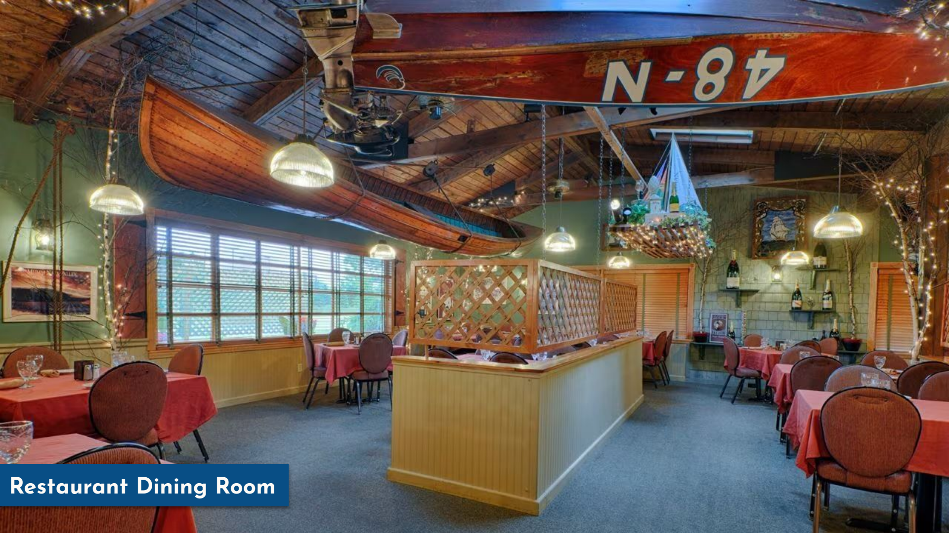
Restaurant Dining Room