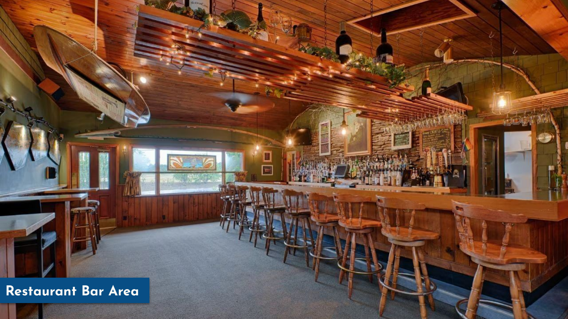
Restaurant Bar Area