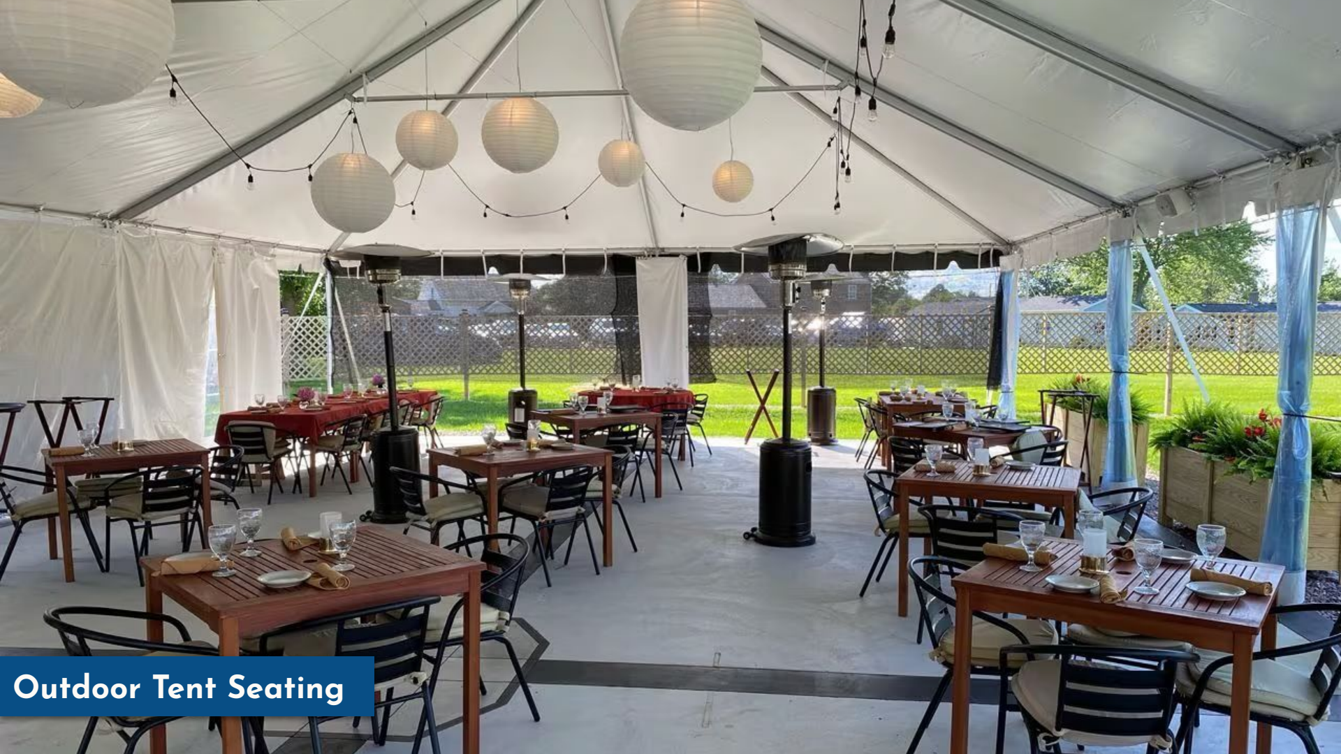
Outdoor Tent Seating