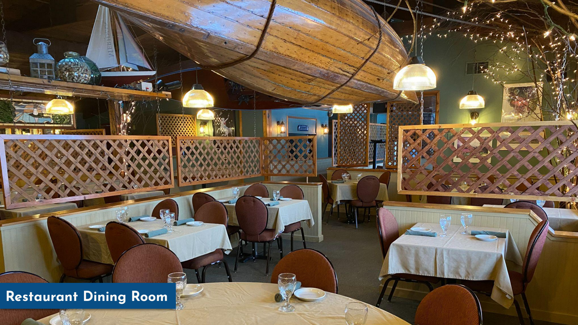
Restaurant Dining Room