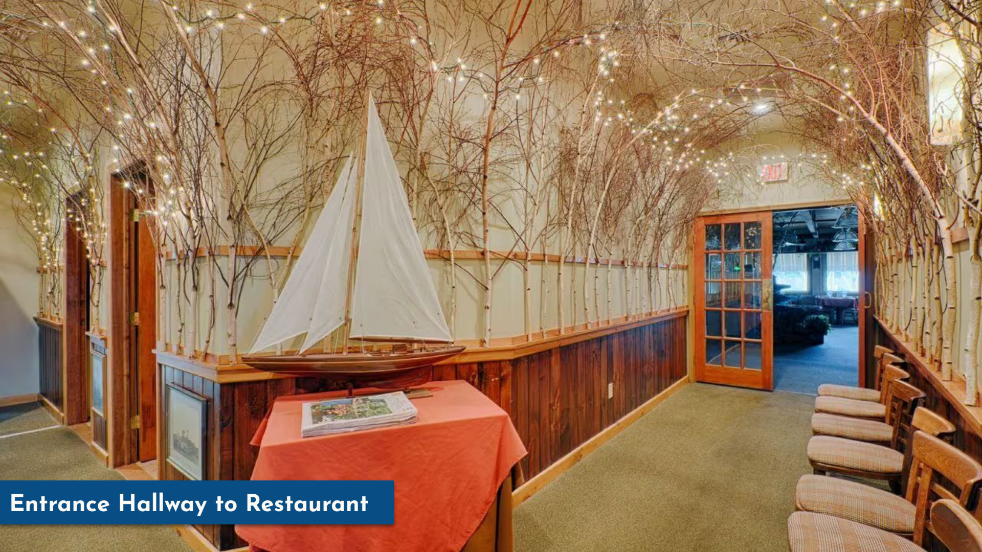
Entrance Hallway to Restaurant