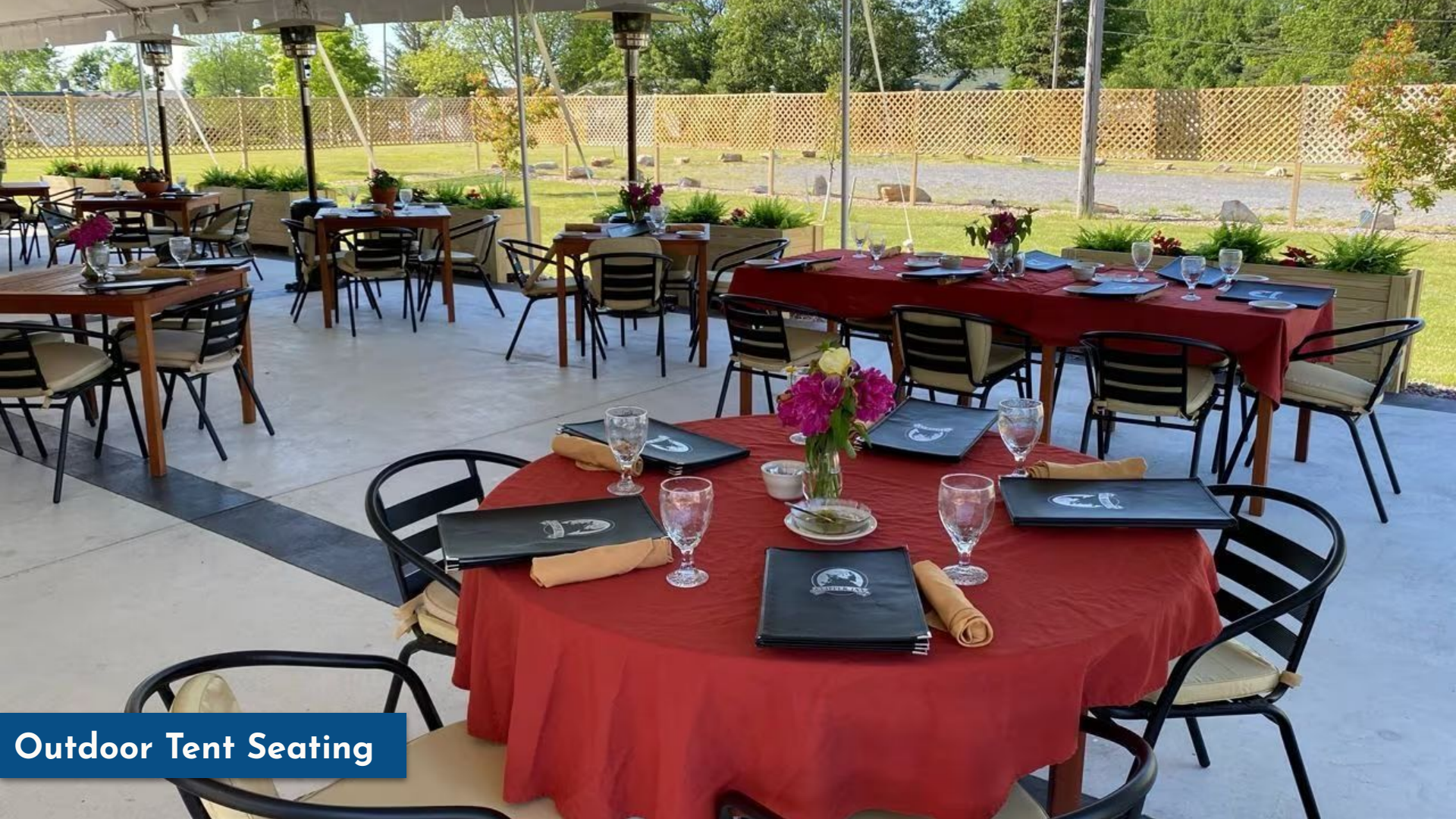
Outdoor Tent Seating