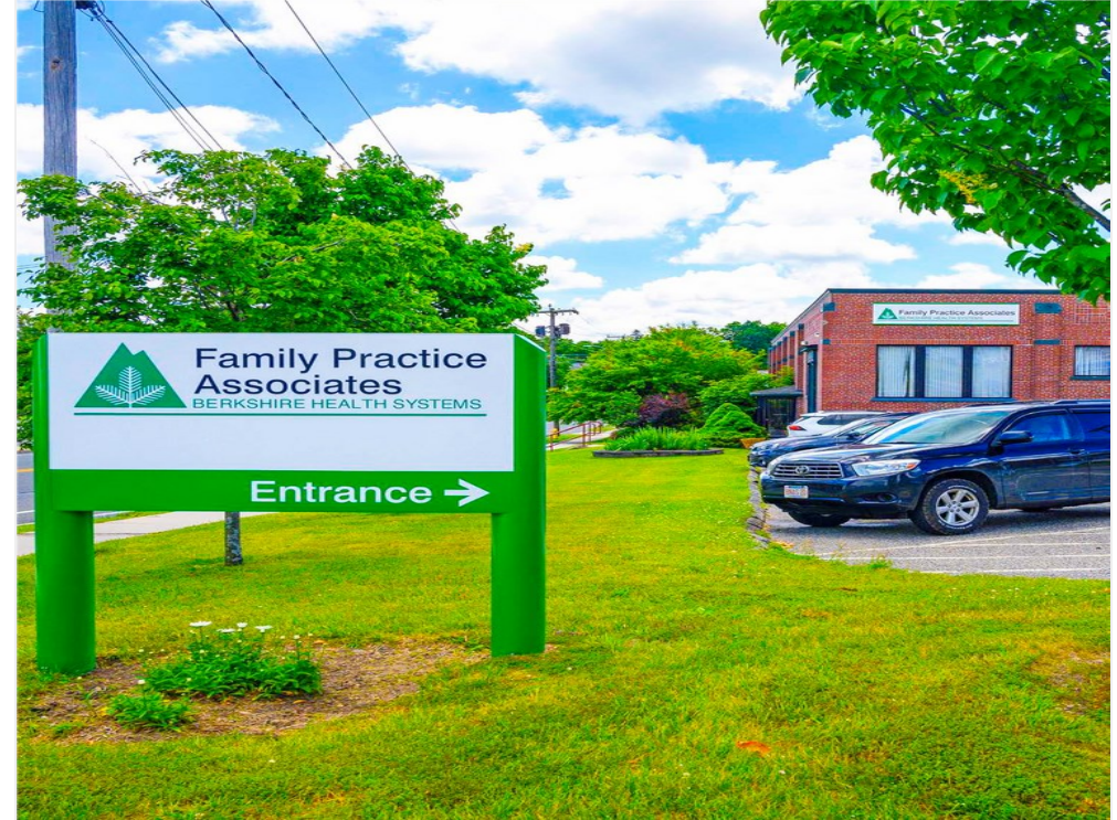
Family Practice Associates