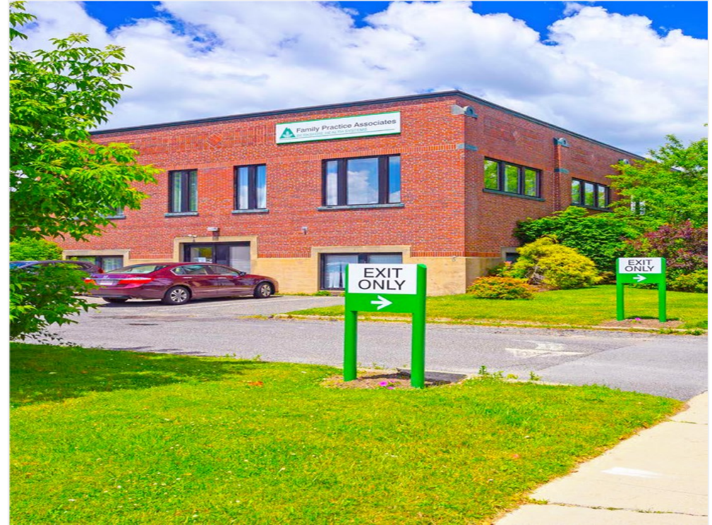
Building Photo Exit Sign