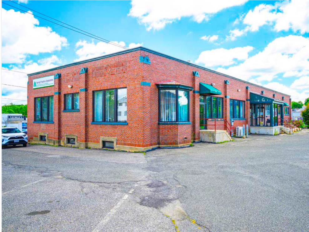
Building Front Left