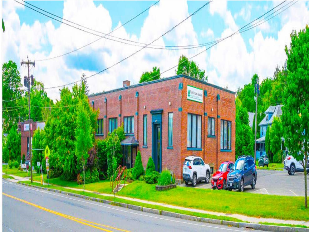
Building Photo Front Right