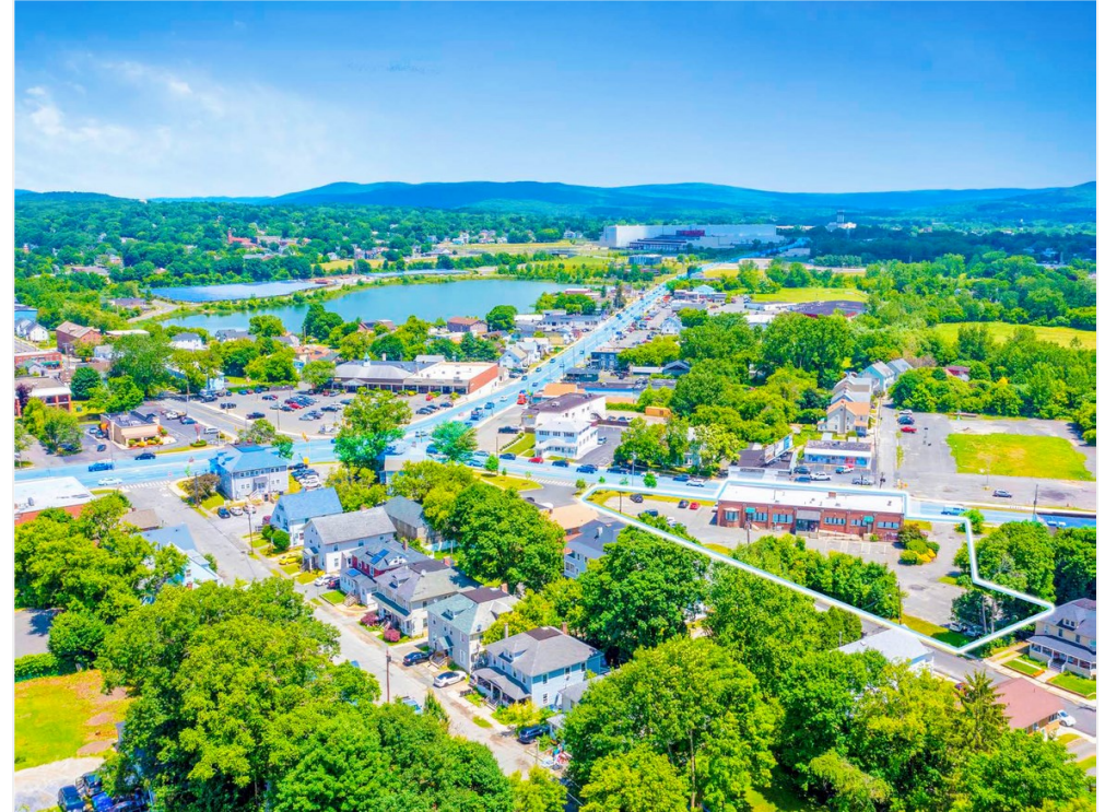
Aerial View 2