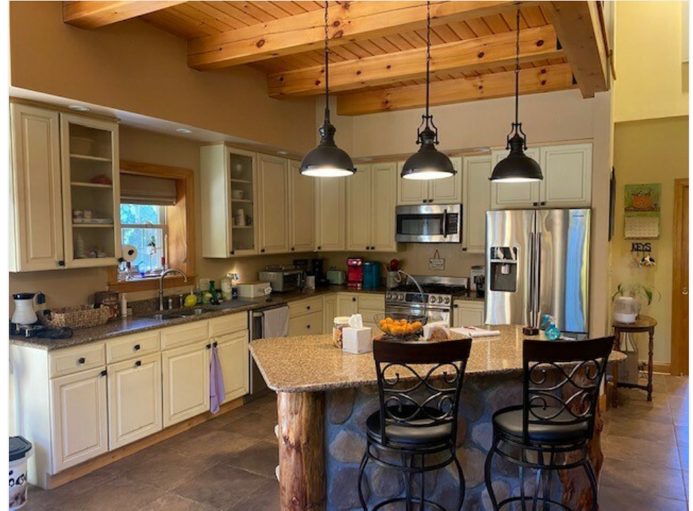
Chefs Kitchen in House