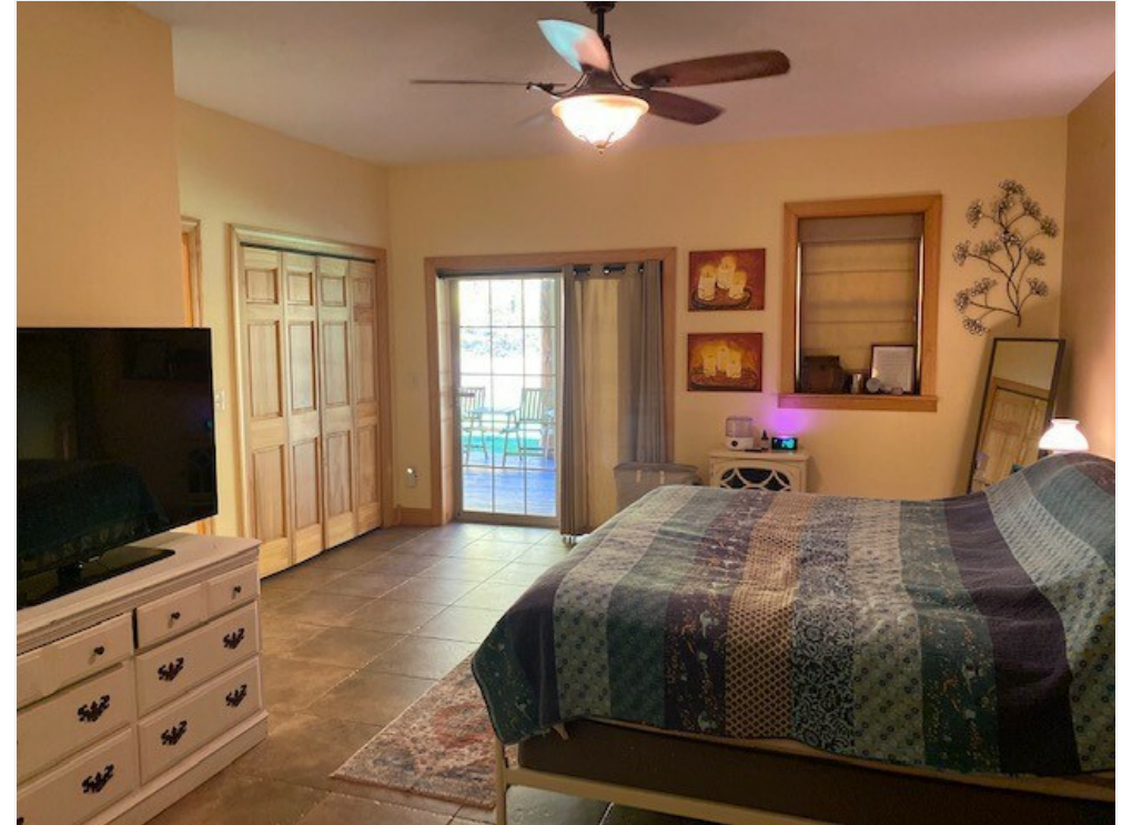
Master Bedroom in House