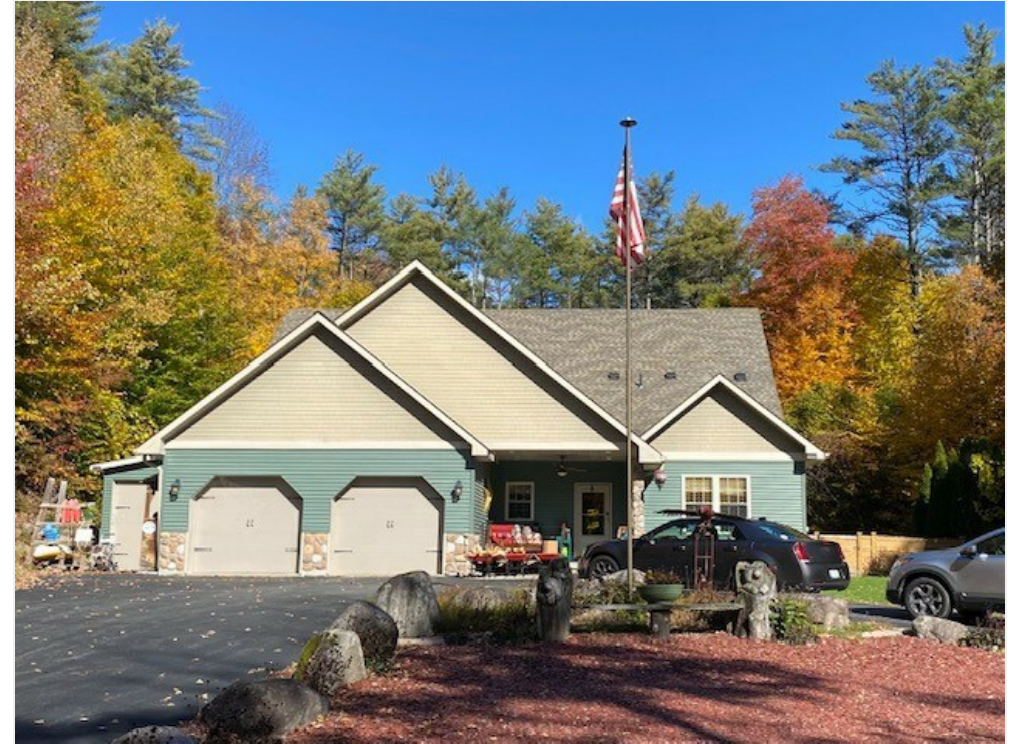
Exterior of Main House