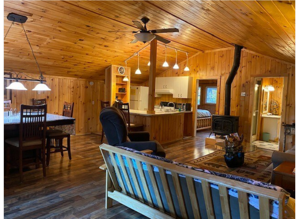
Fabulous Living Space