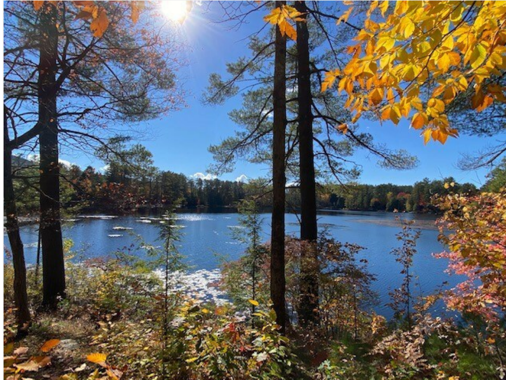
Picturesque View of the Lake