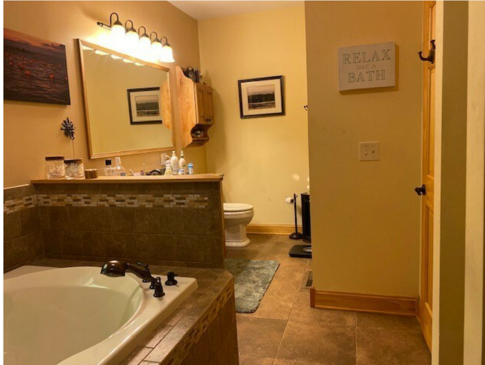
Four Fixture Master Bath in House