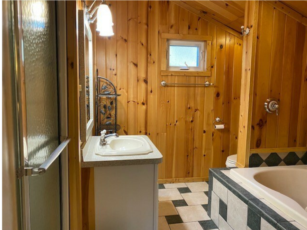
Cottage Bathroom with Shower and Jacuzzi