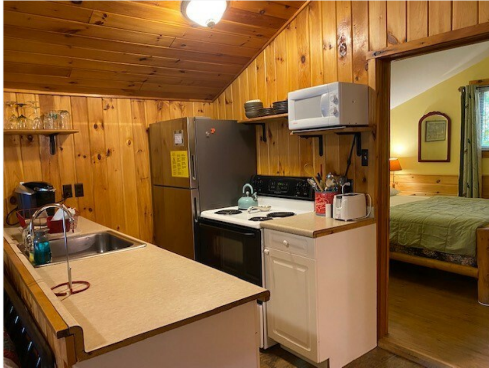
Full Kitchens in Cottages