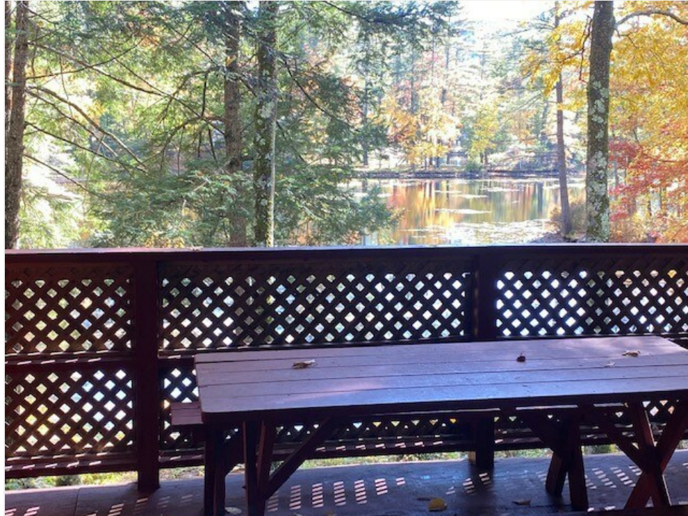
Cottages with Decks overlooking the Lake