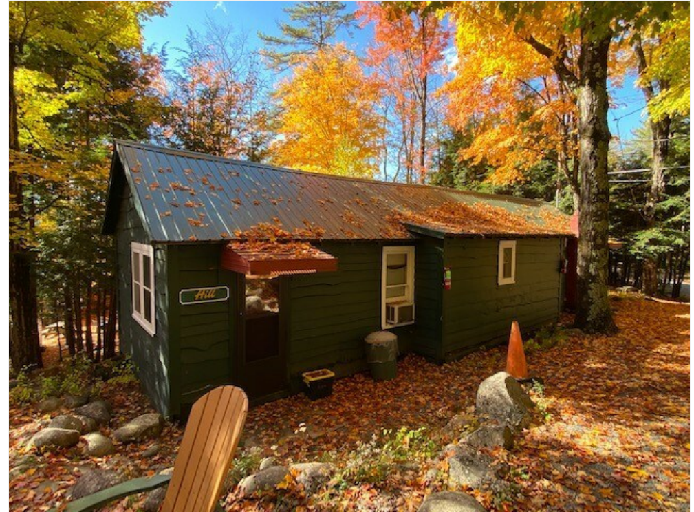
Autumn Scene Cottages