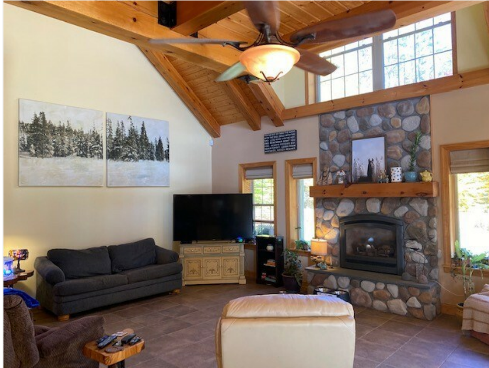
Living Room in House