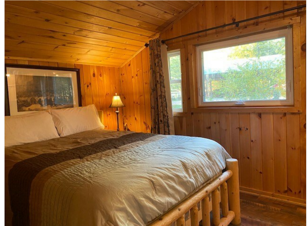
Warm and Cozy King