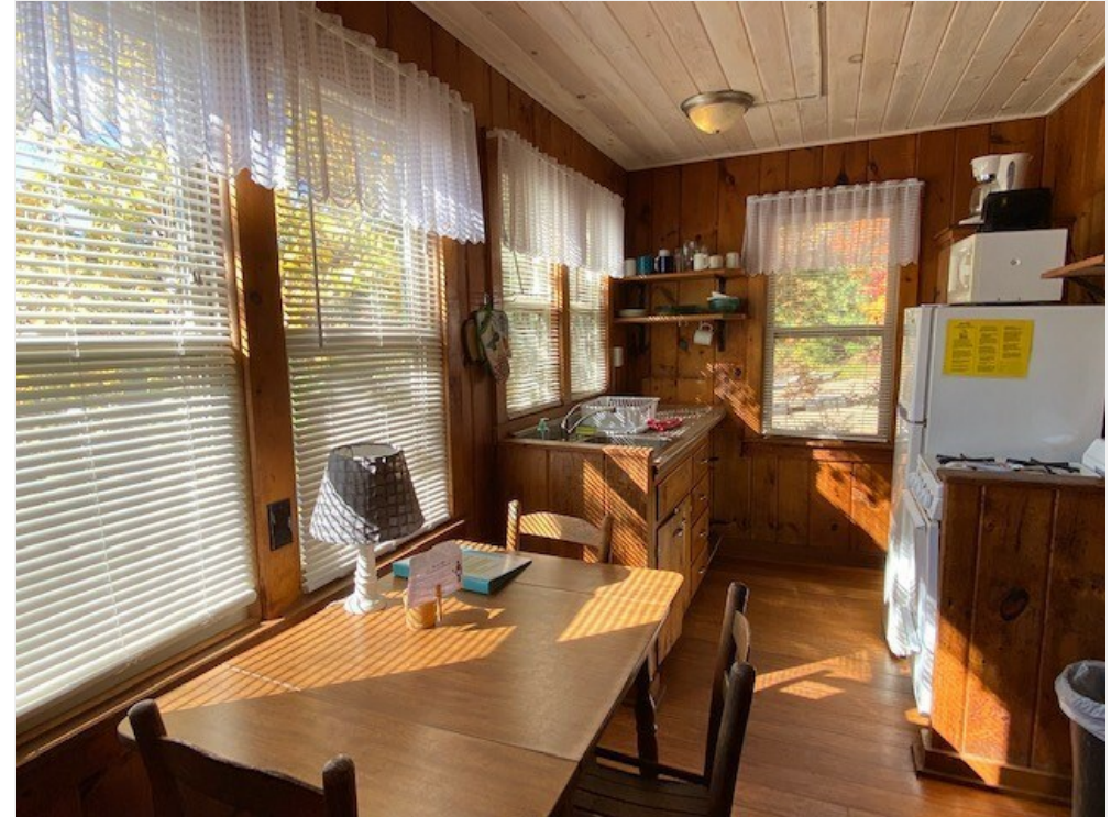
Cozy Kitchen on the Lake