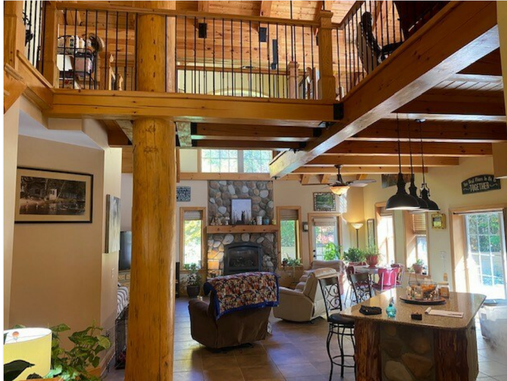
Atrium of House