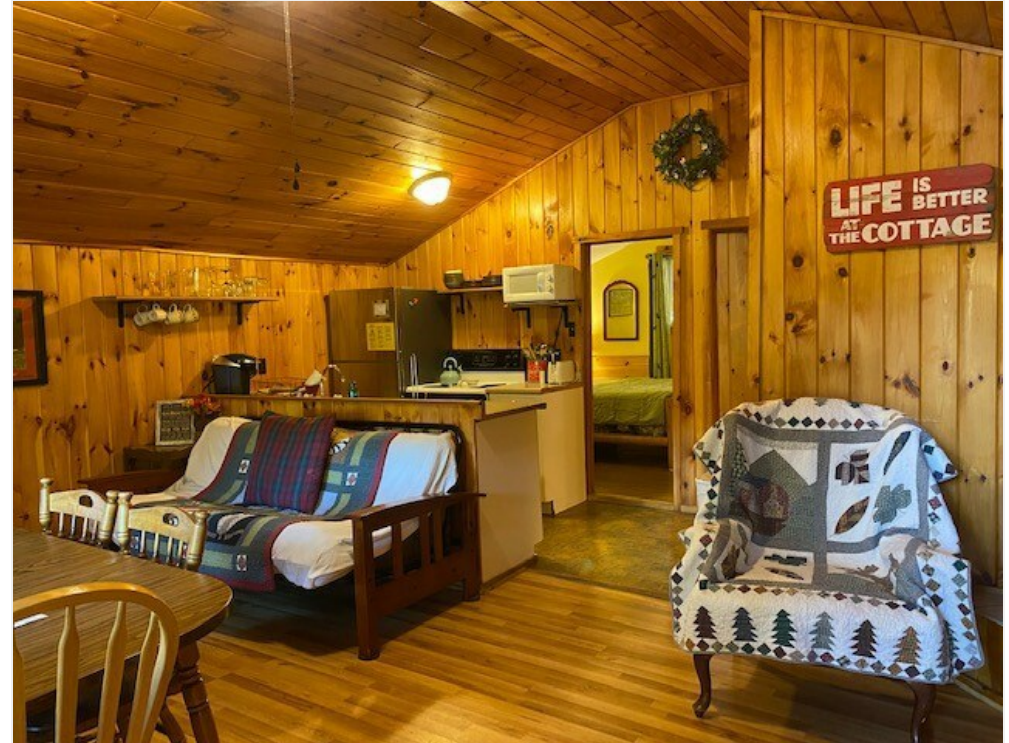
Spacious Living Area in cottage