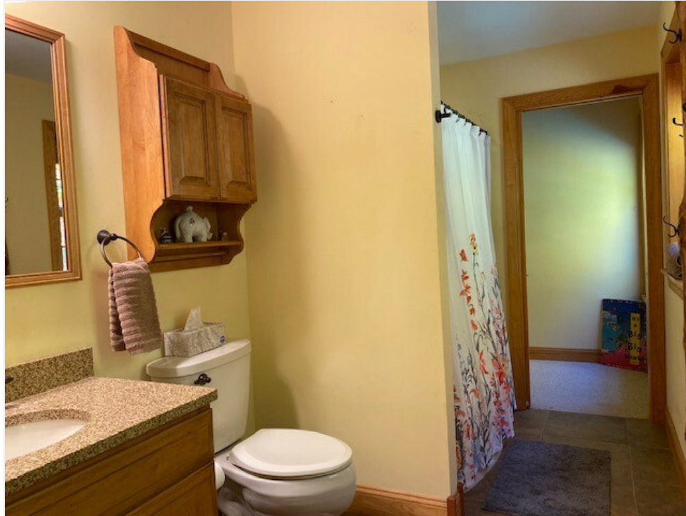
Family Bathroom - House