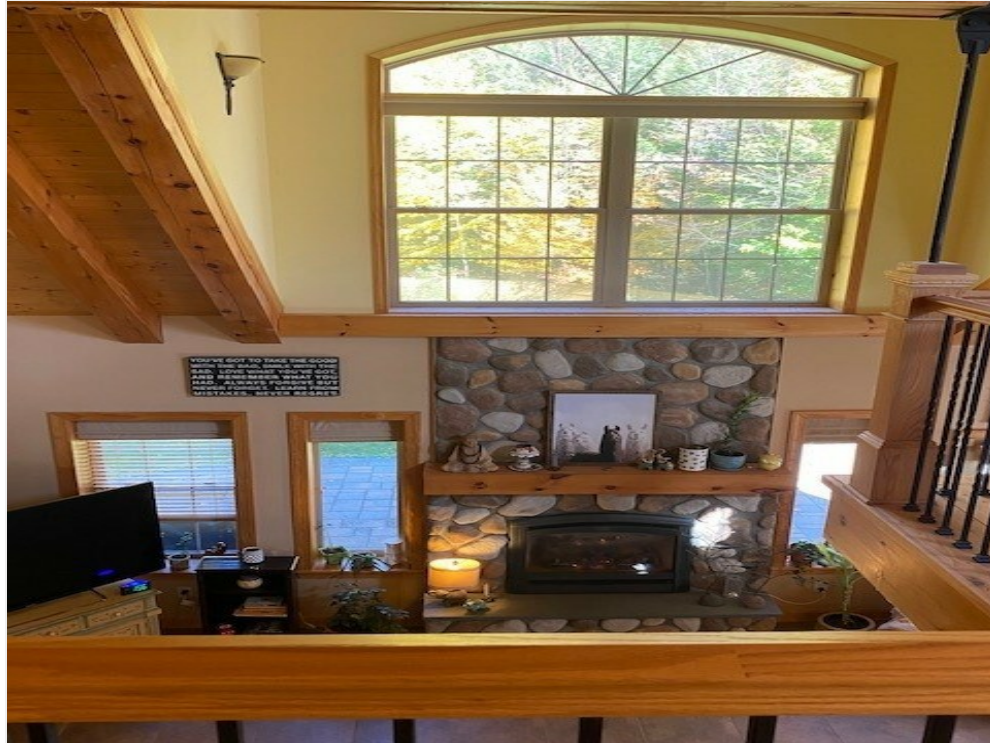
Beautiful Atrium in House