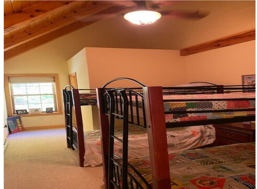
Bunkbeds in House