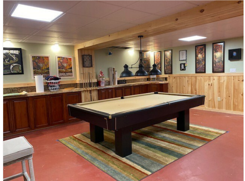
Billiard Room - House