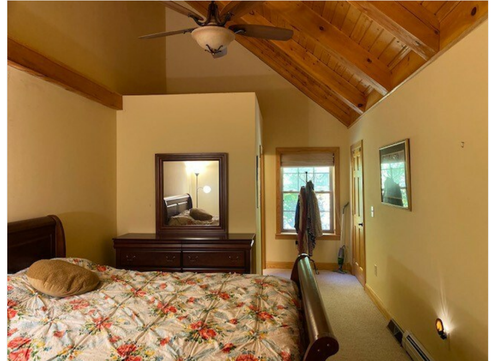
Bedroom - House