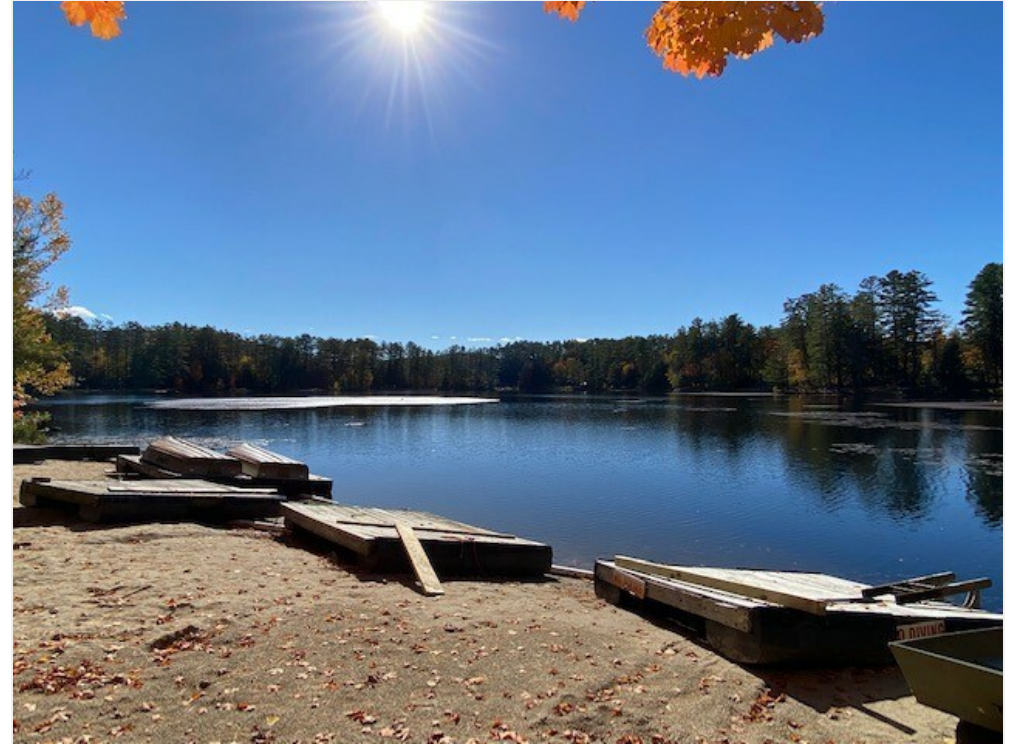
Private Beach with Watersports