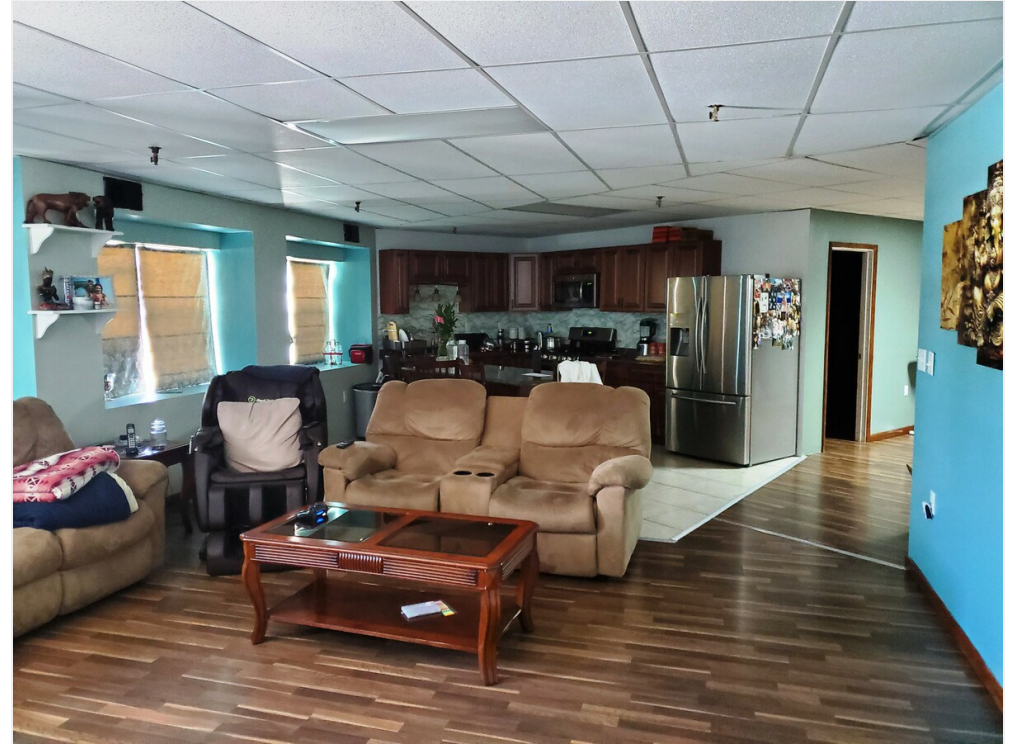
Owners Living Room