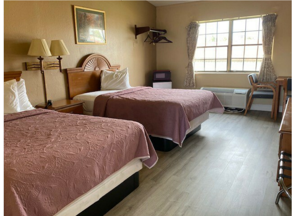
Double Double 2