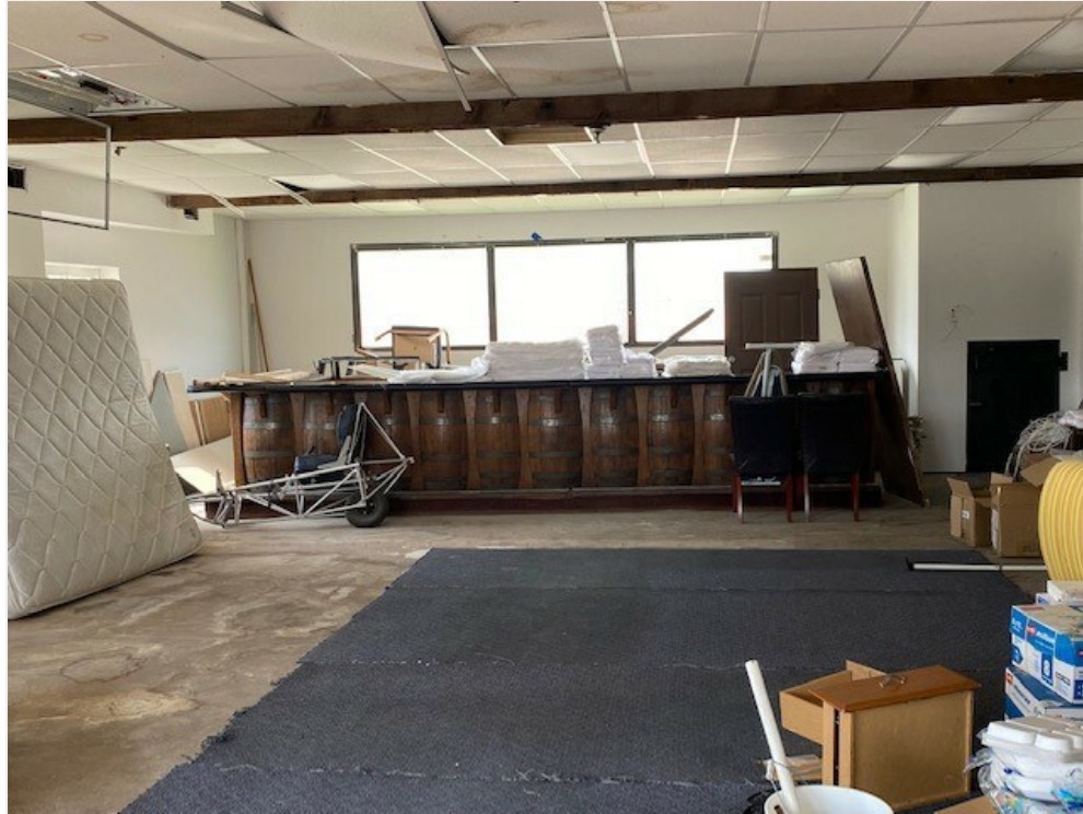
Large Former Bar Area - currently Storage