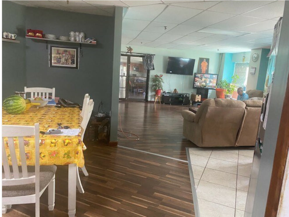
Living Area in Owners Quarters