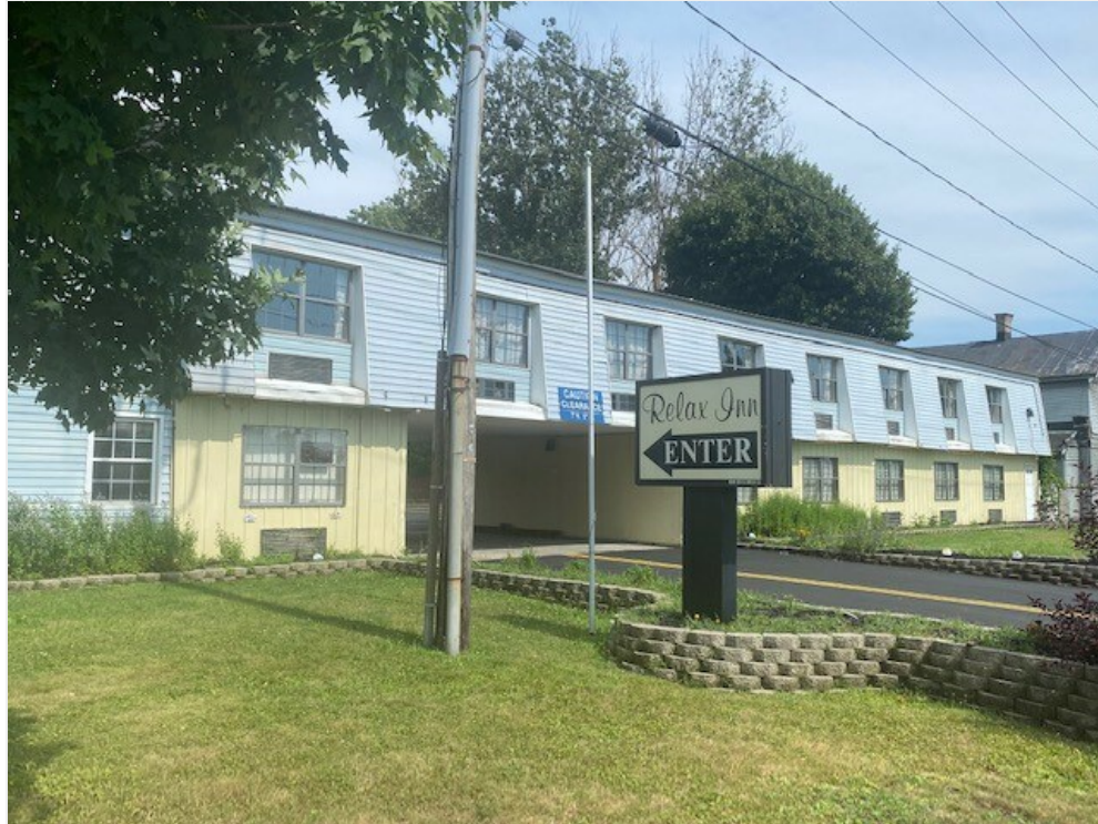
Relax Inn Entrance