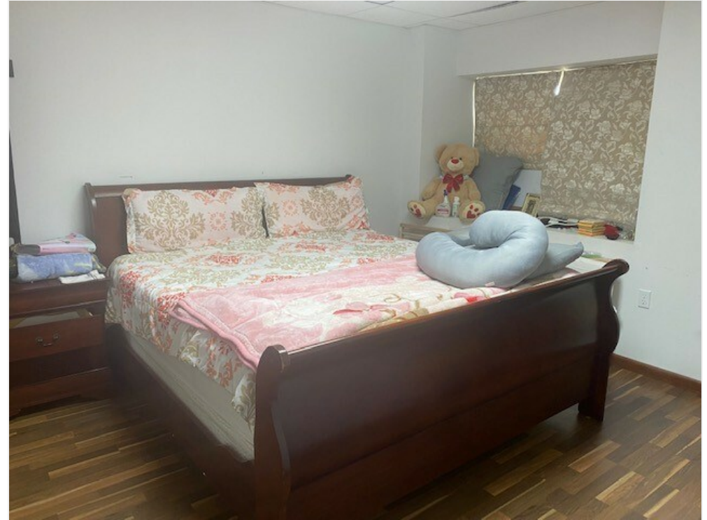
Bedroom in Owners Quarters