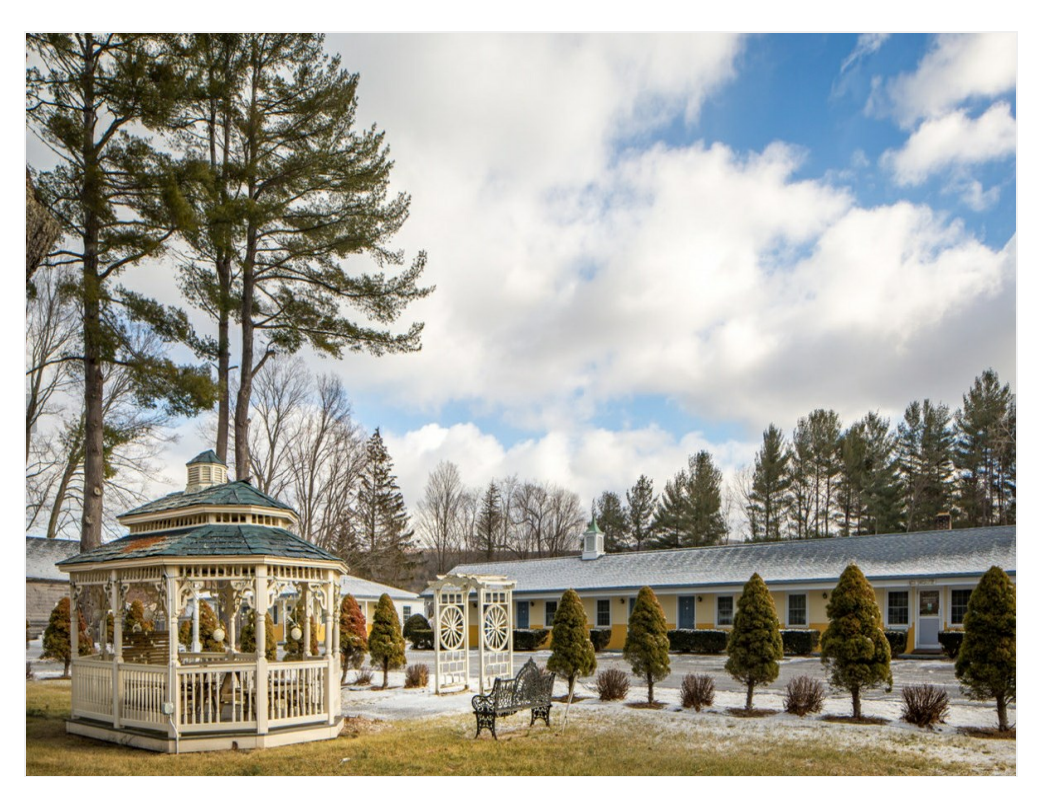
Suite Building Beautiful Winter Scene