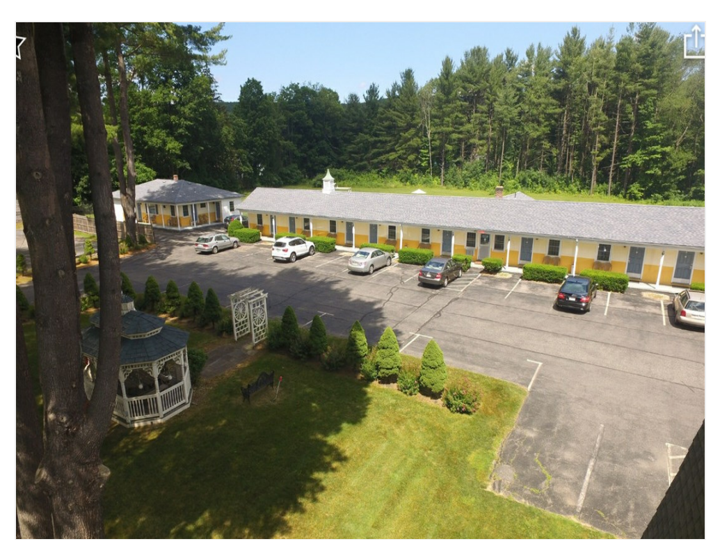
Lantern House Campus Motel Photo