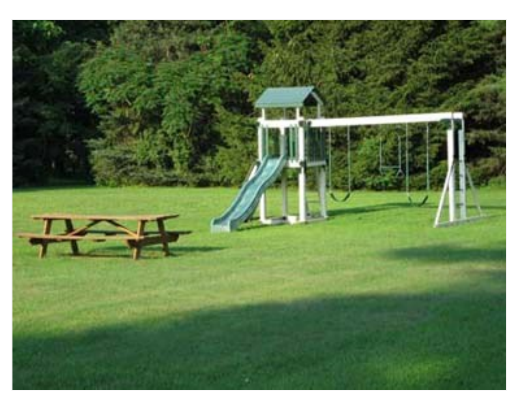
Owners House - Reception Children's Playground