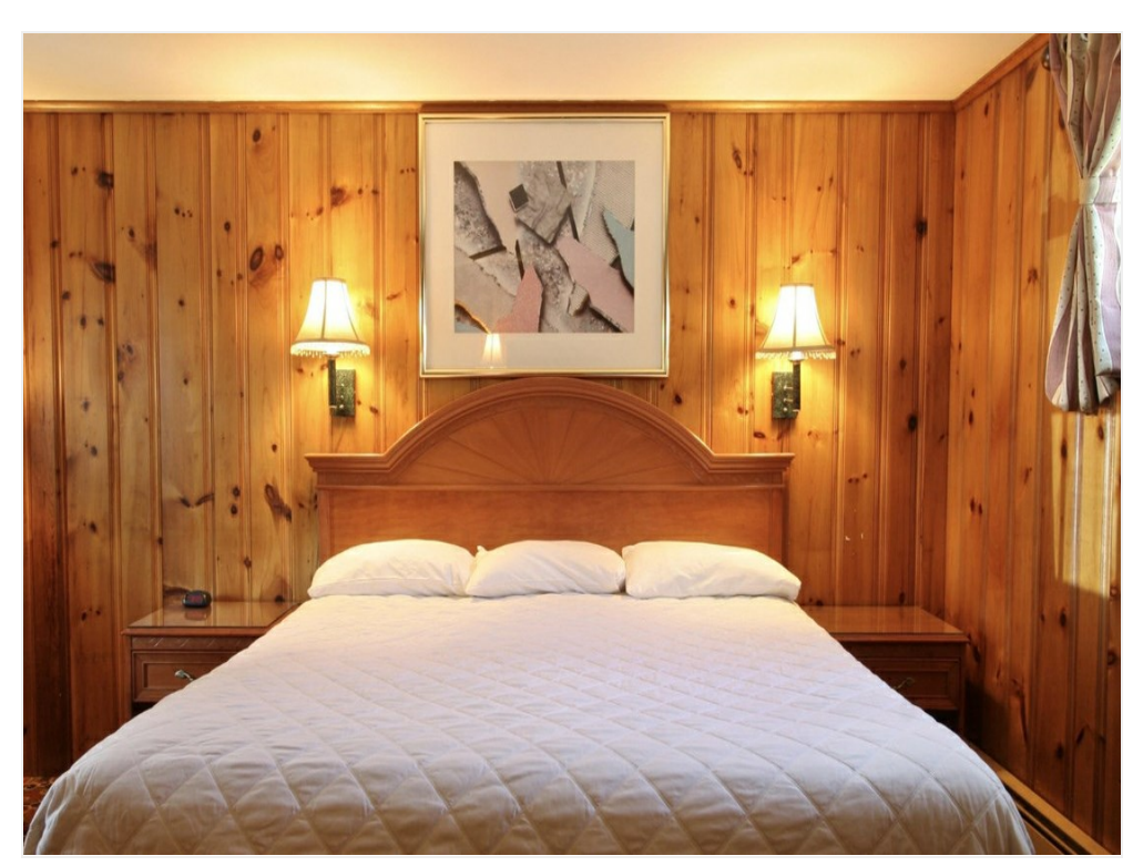
King Bedded Guest Room King Bed