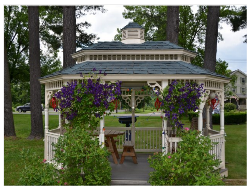
Guest Reception - Lobby Gazebo