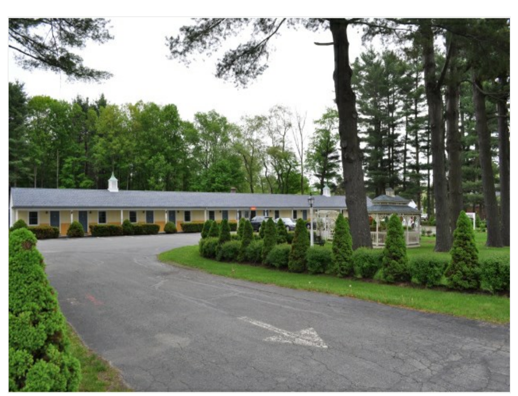
King Suite Driveway - Motel Exterior