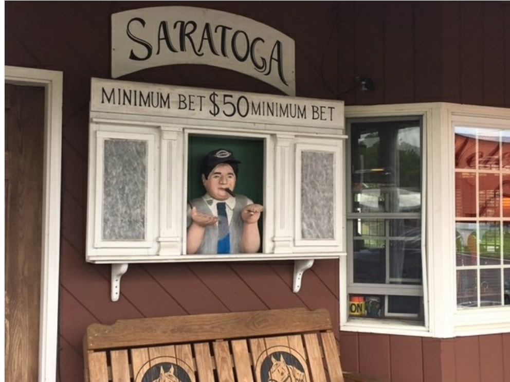
Ticket Window Art Design