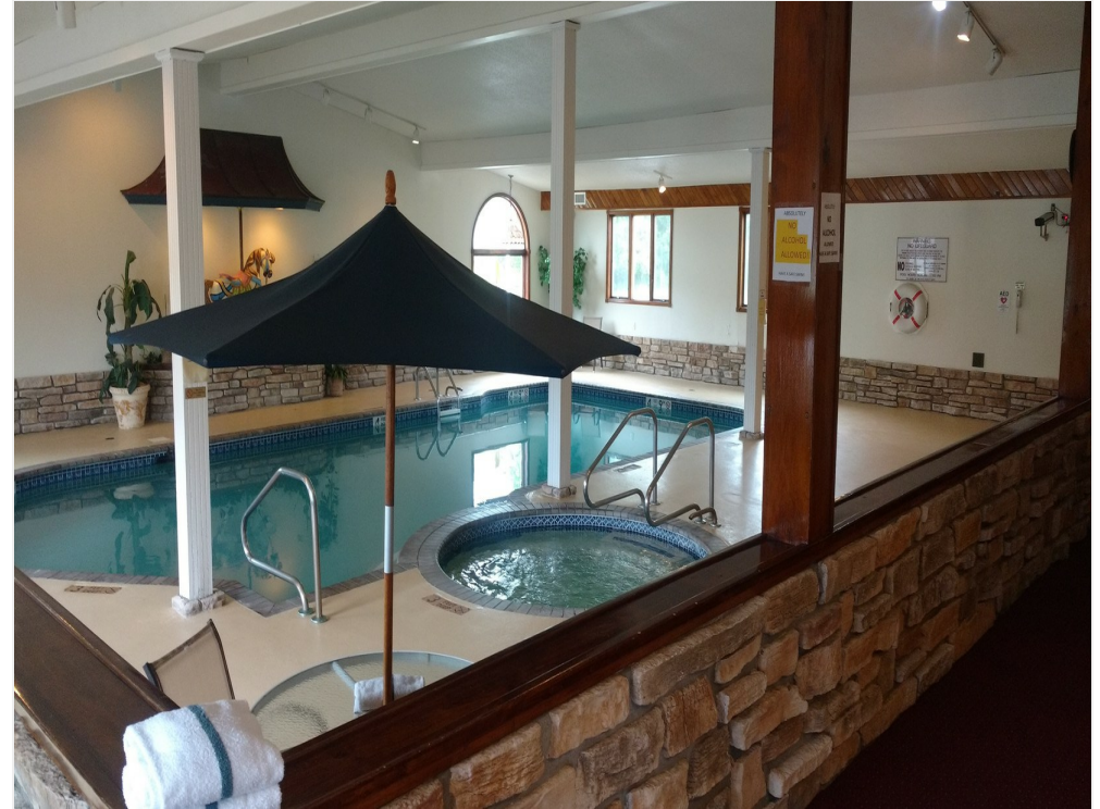
Indoor Pool and Spa