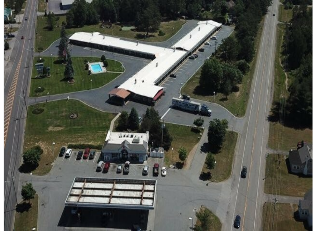
Aerial of Site