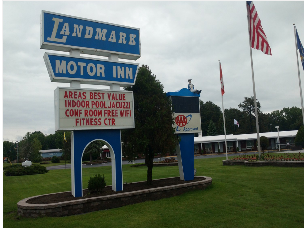
Iconic Pylon Sign