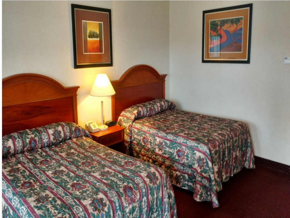
Double Bedded Room