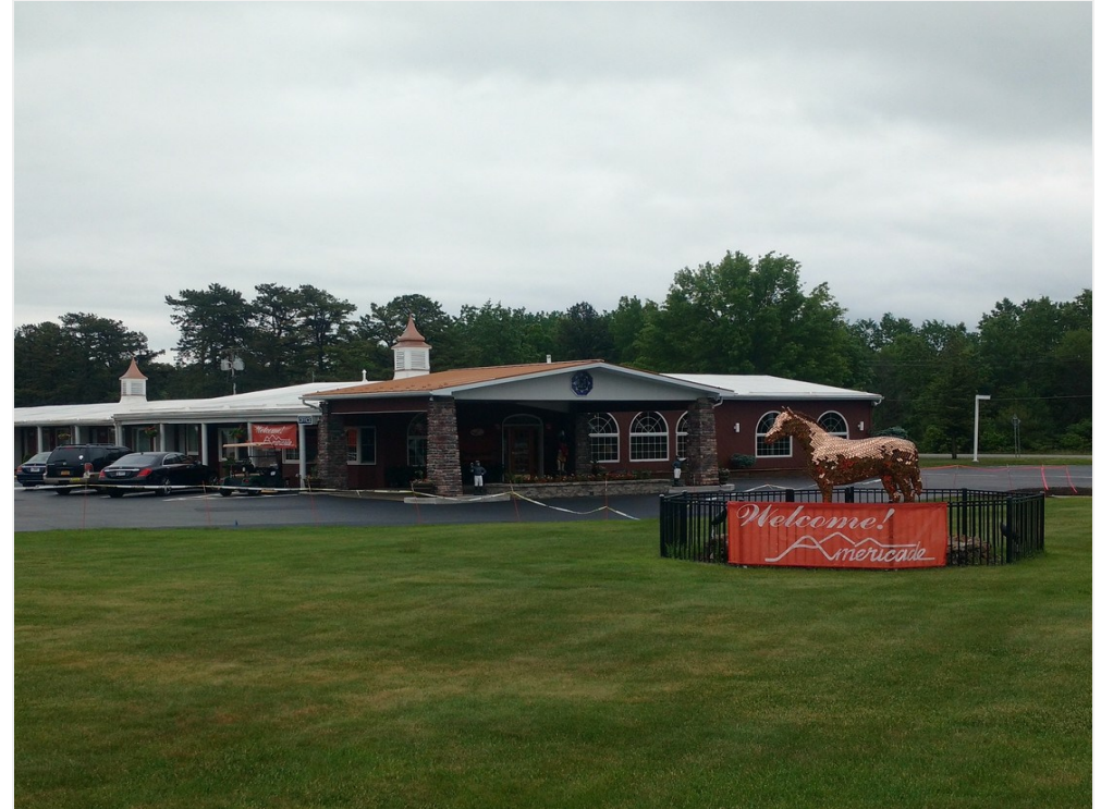
Near to Saratoga Race Course