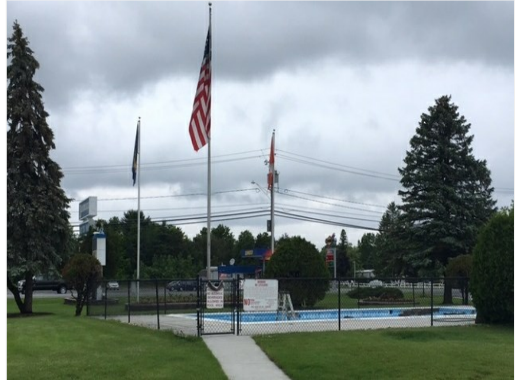
Outdoor Swimming Pool