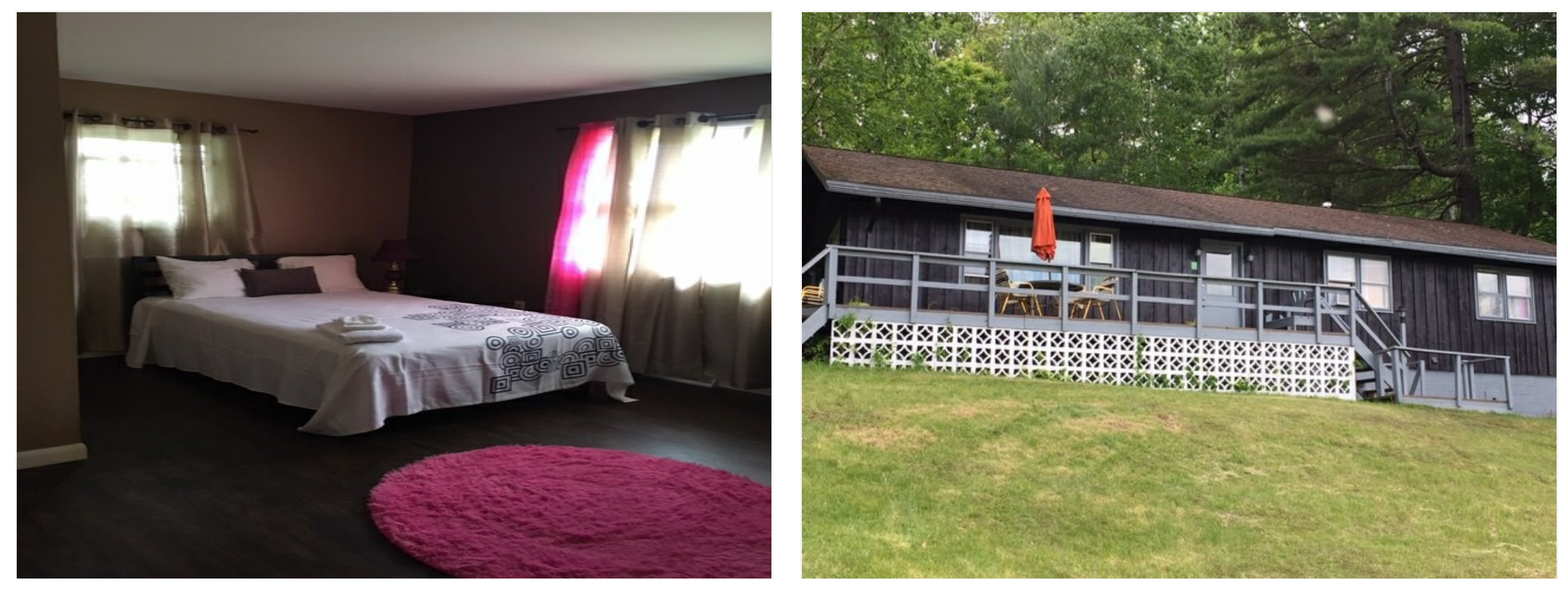
Guest House Bedroom (1 of 7) Travelodge, Lake George

2009 State Route 9, Lake George, NY 12845