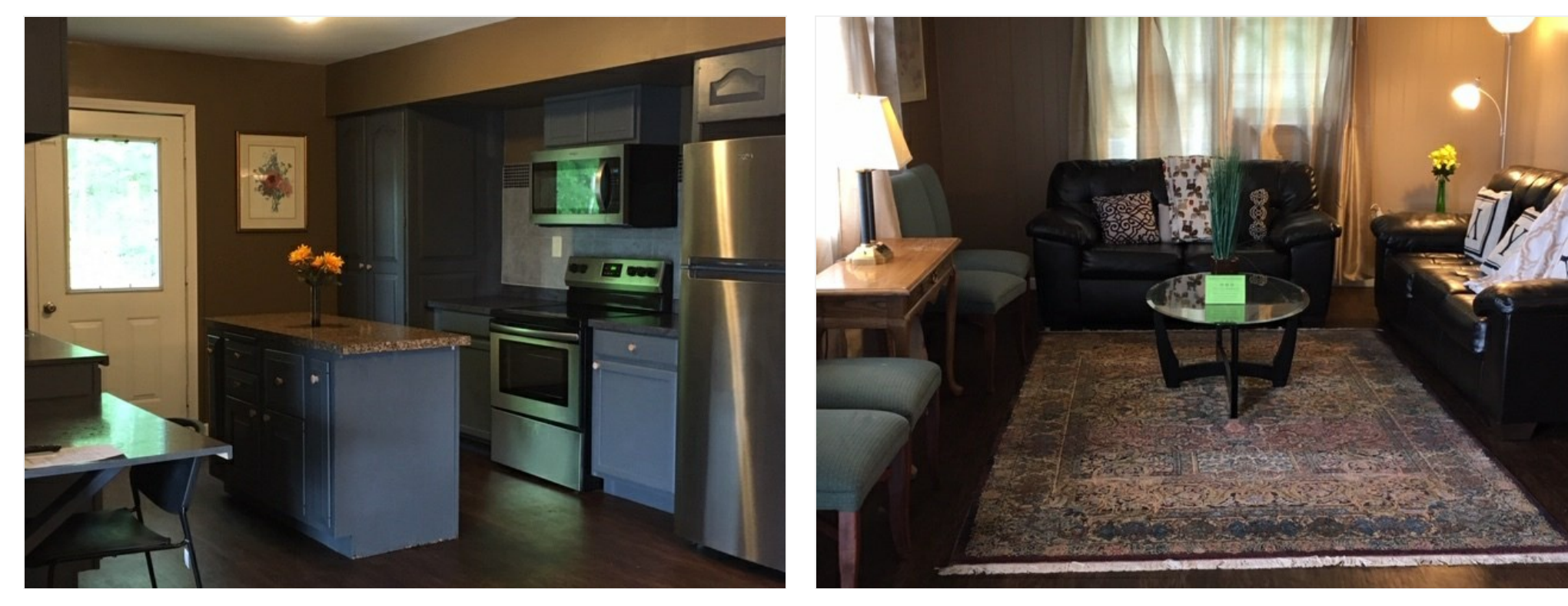
Kitchen, Guest House - Travelodge, Lake George

2009 State Route 9, Lake George, NY 12845