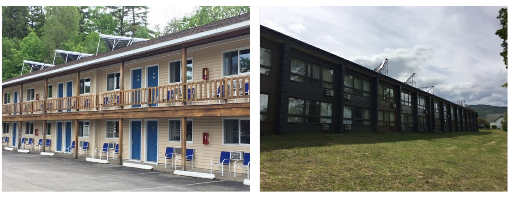
New Building Lake George Travelodge