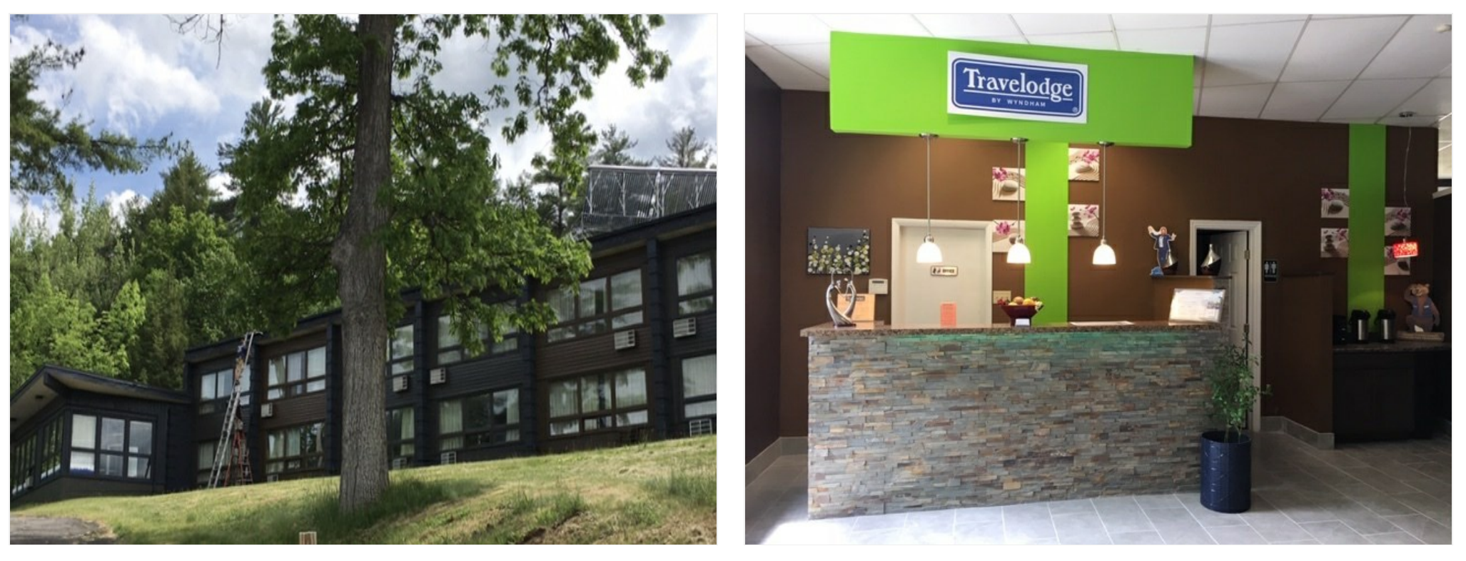
Travelodge - 2009 State Rt 9 Lake George, New York