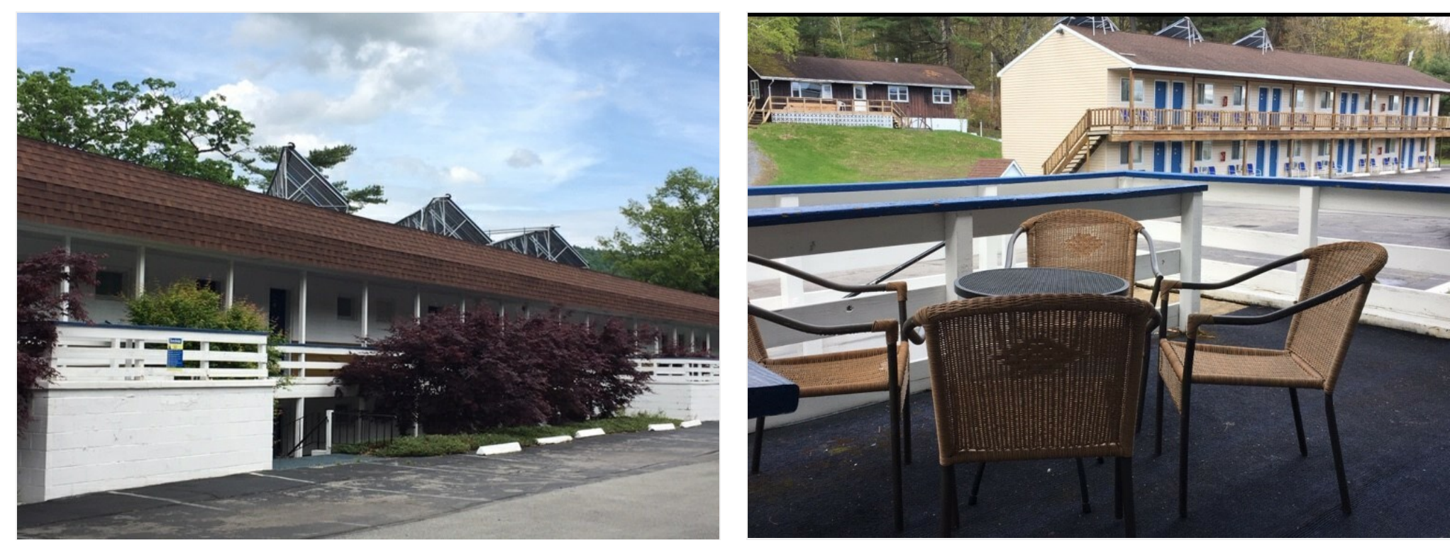
Original Building Lake George Travelodge