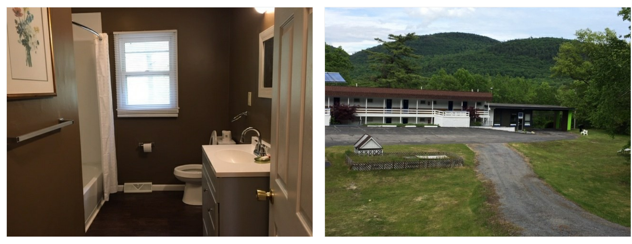
Bathroom Guest House - Travelodge, Lake George