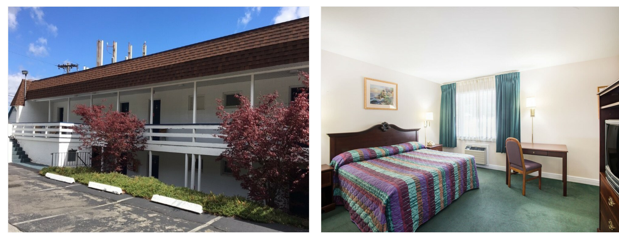
Front Exterior 1 Travelodge LG

2009 State Route 9, Lake George, NY 12845