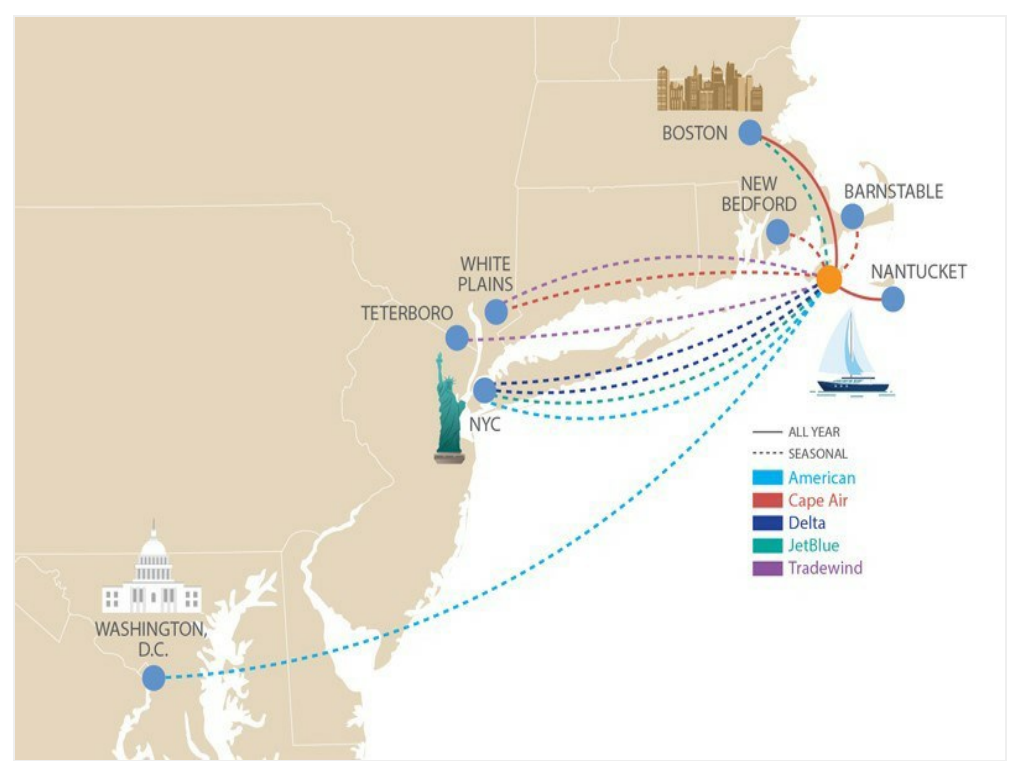
Martha's Vineyare Airport Route Map