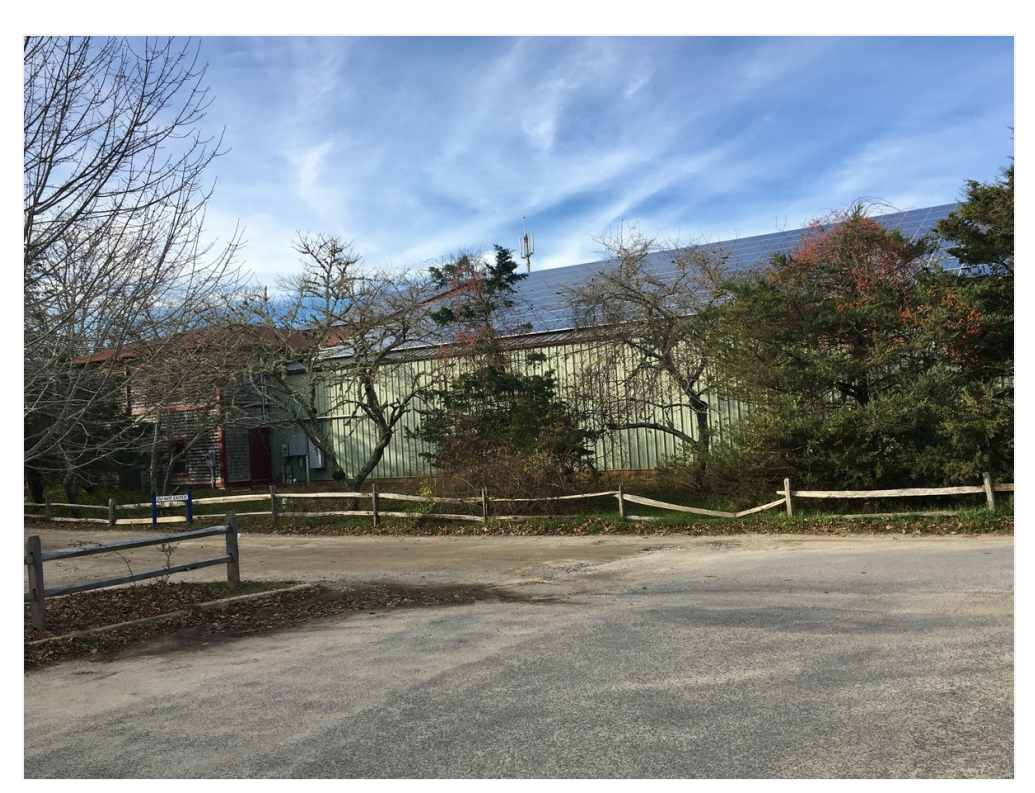
Airport Fitness building