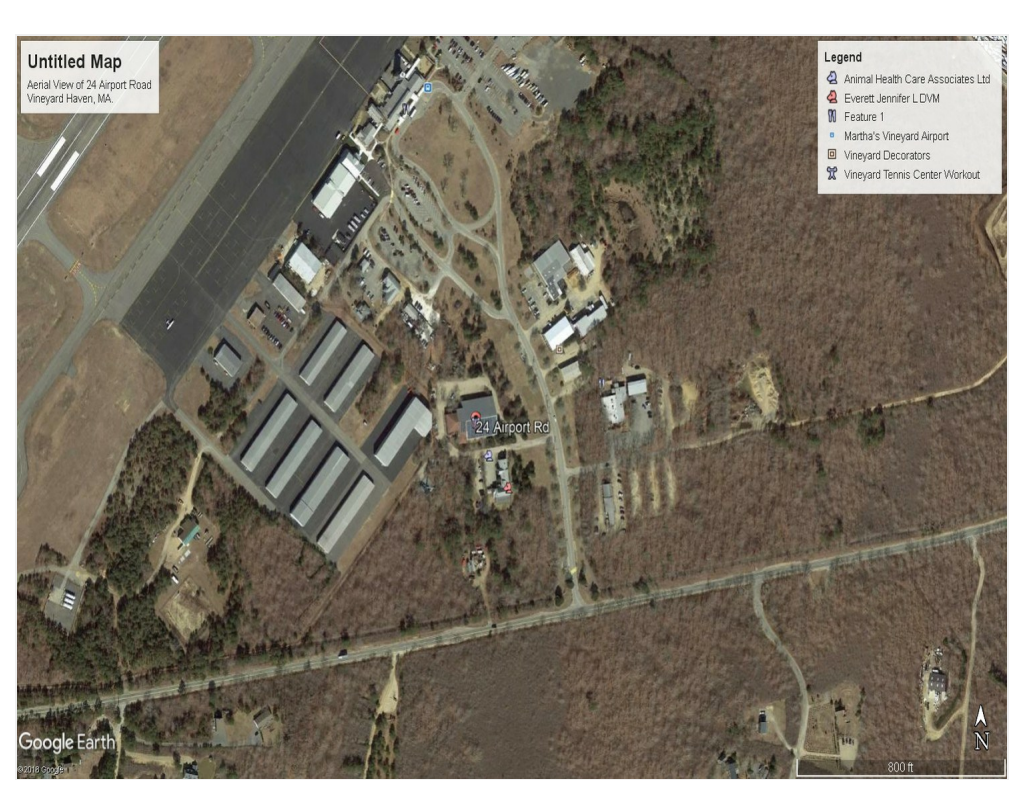
Aerial View 24 Airport Road; Vineyard Haven, MA